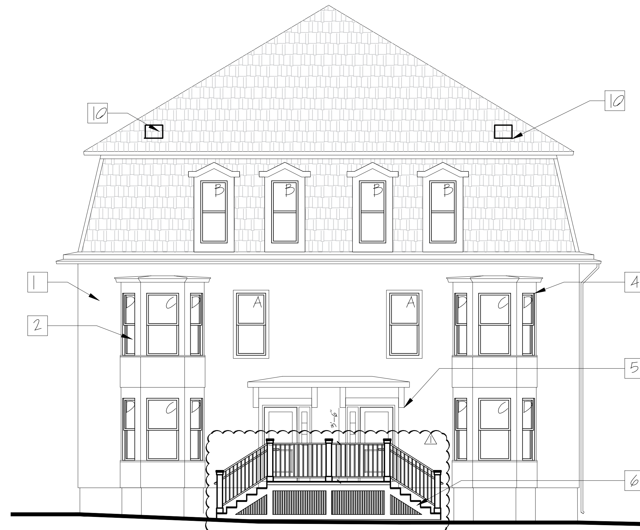
4 SOUTH ELEVATION 0 5'-4" SCALE: 3/16" = 1'-0"