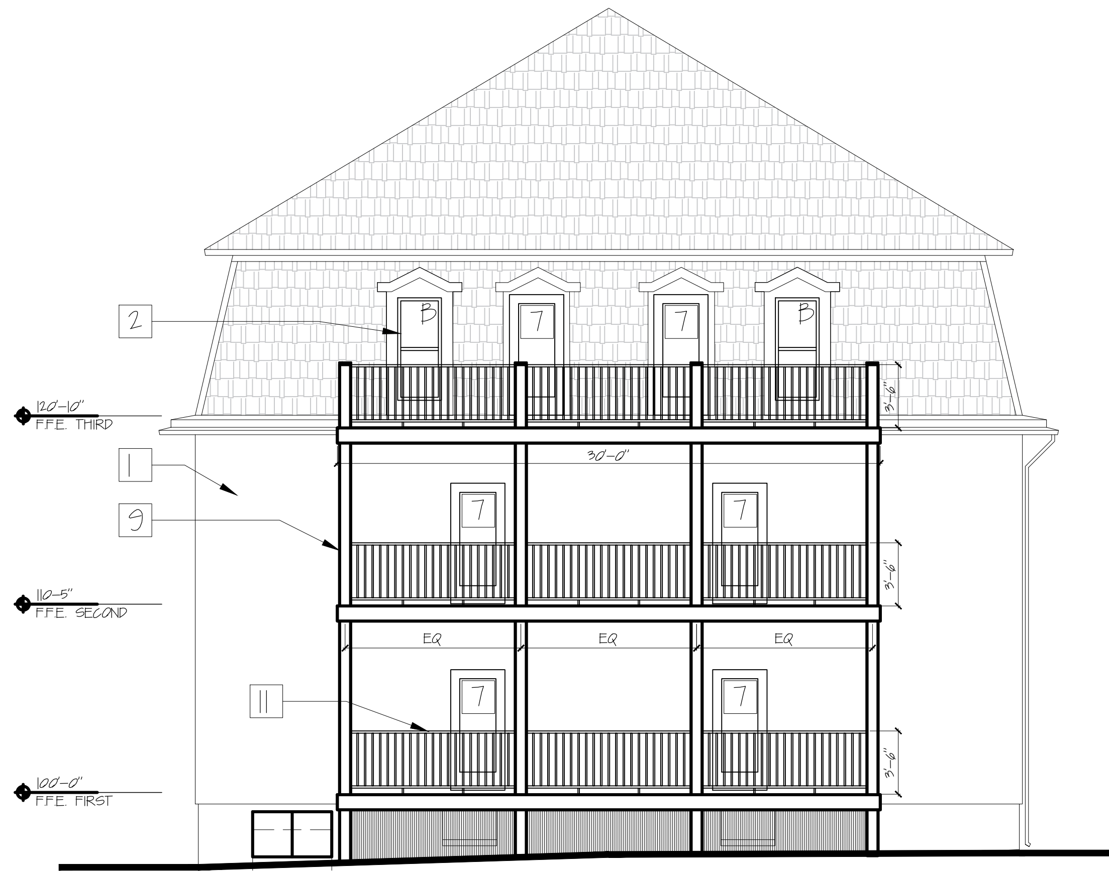
1 NORTH ELEVATION 0 5'-4" SCALE: 3/16" = 1'-0"