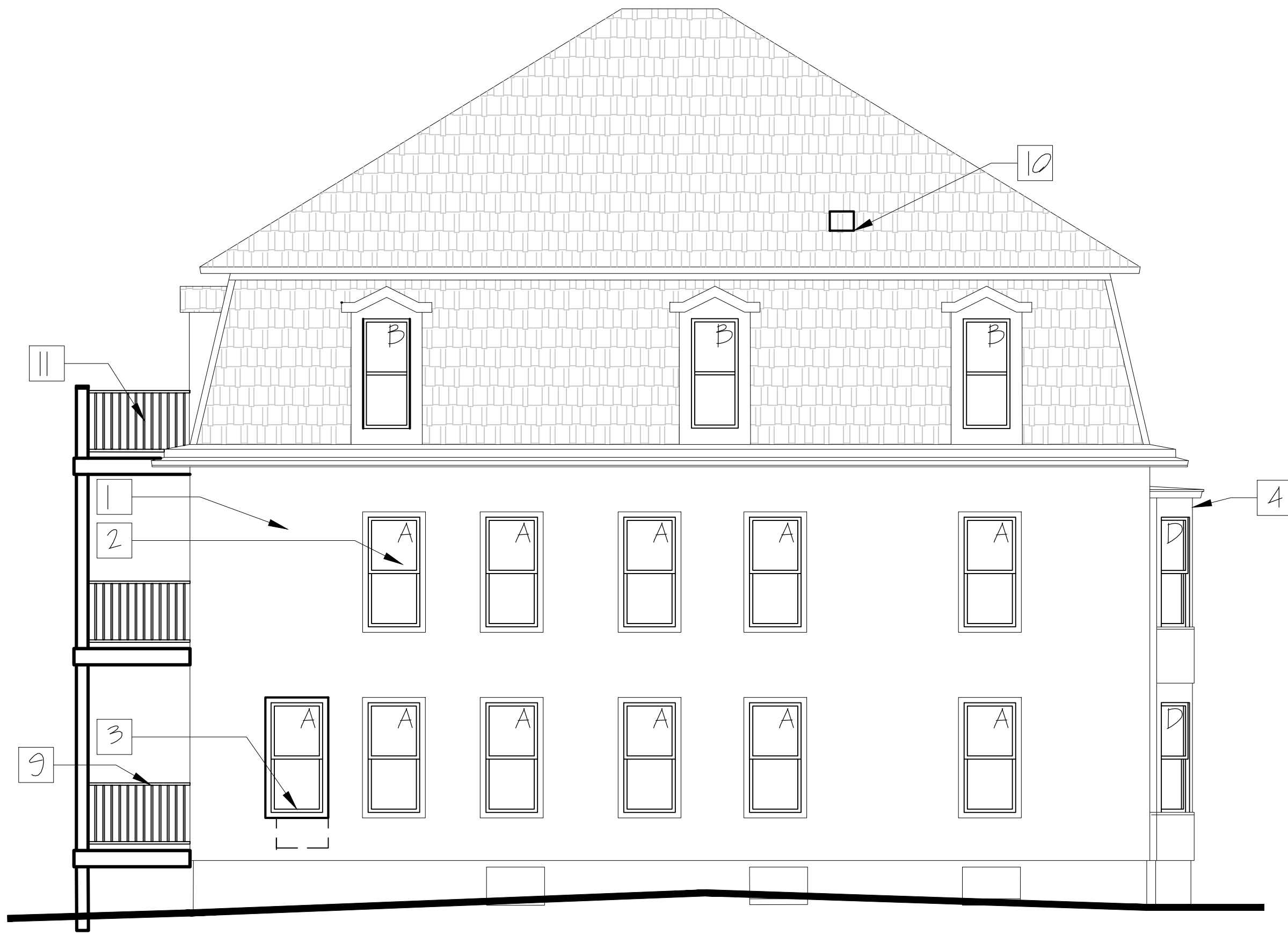
3 WEST ELEVATION 0 5'-4" SCALE: 3/16" = 1'-0"