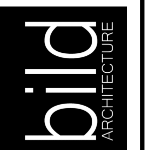
Bild Architecture PO Box 8235 Portland, ME 04104 207.408.0168 evan@bildarchitecture.com