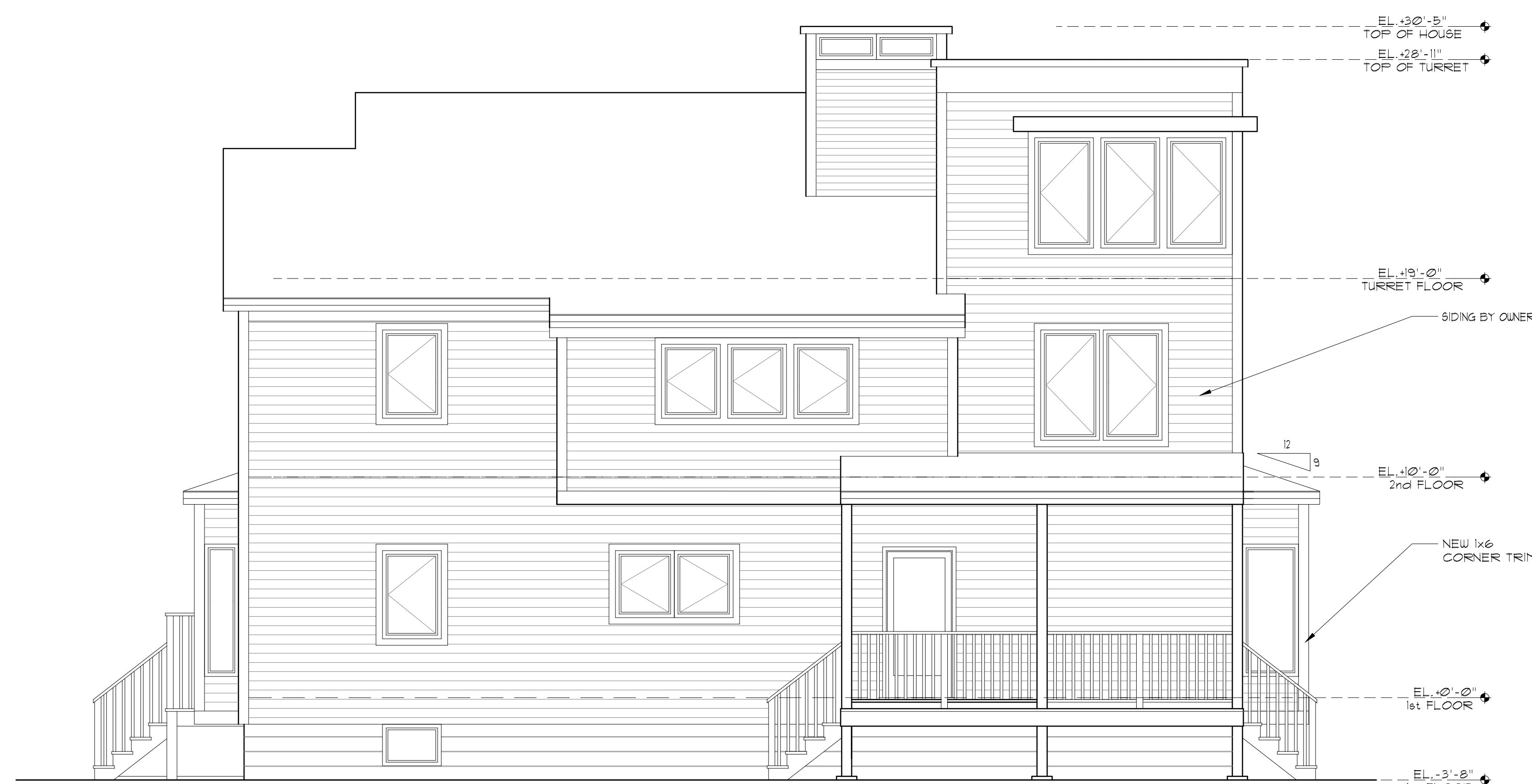
LEFT ELEVATION SCALE: 1/4"=1'-0"

NOTE: THIS DRAWING IS PROVIDED FOR INFORMATIONAL PURPOSES ONLY. IF USED FOR CONSTRUCTION, THE CONTRACTOR ASSUMES ALL RESPONSIBILITY FOR LOCAL CODE COMPLIANCE. ALL DRAWINGS, PLANS, SKETCHES, ETC. ARE PROVIDED TO OUR CLIENTS BASED UPON INFORMATION PROVIDED BY THE CLIENT AND DRAIN IN ACCORDANCE WITH COMMON BUILDING PRACTICES AND LOCAL CODES. NONE OF THE EMPLOYEES OF FMC CADD DRAFTING SERVICES, INC. ARE REGISTERED ARCHITECTS, ENGINEERS OR LAND SURVEYORS. ALL DIMENSIONS AND SPECIFICATIONS SHOULD BE VERIFIED BY CLIENT AND/OR CONTRACTOR BEFORE ACTUAL CONSTRUCTION BEGINS. IF DIMENSIONS AND SPECIFICATIONS ARE NOT VERIFIED BY CLIENT AND/OR CONTRACTOR BEFORE ACTUAL CONSTRUCTION BEGINS FMC CADD DRAFTING SERVICES, INC. WILL BE HELD HARMLESS. FMC CADD DRAFTING SERVICES, INC. ASSUMES NO LIABILITY FOR CHANGES AND/OR REVISIONS MADE TO PLANS BY CLIENT AND/OR CONTRACTOR.