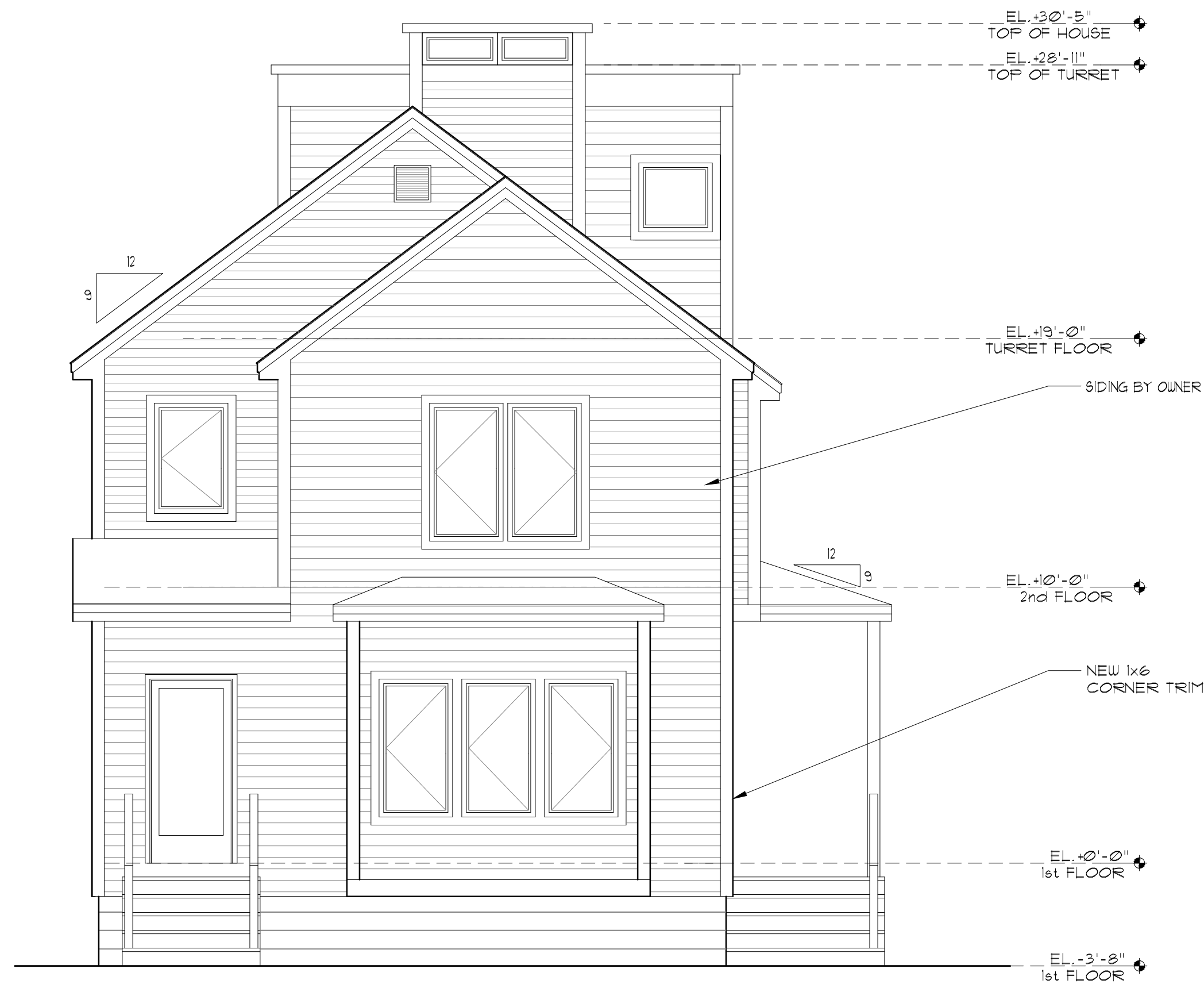
FRONT ELEVATION SCALE: 1/4"=1'-0"