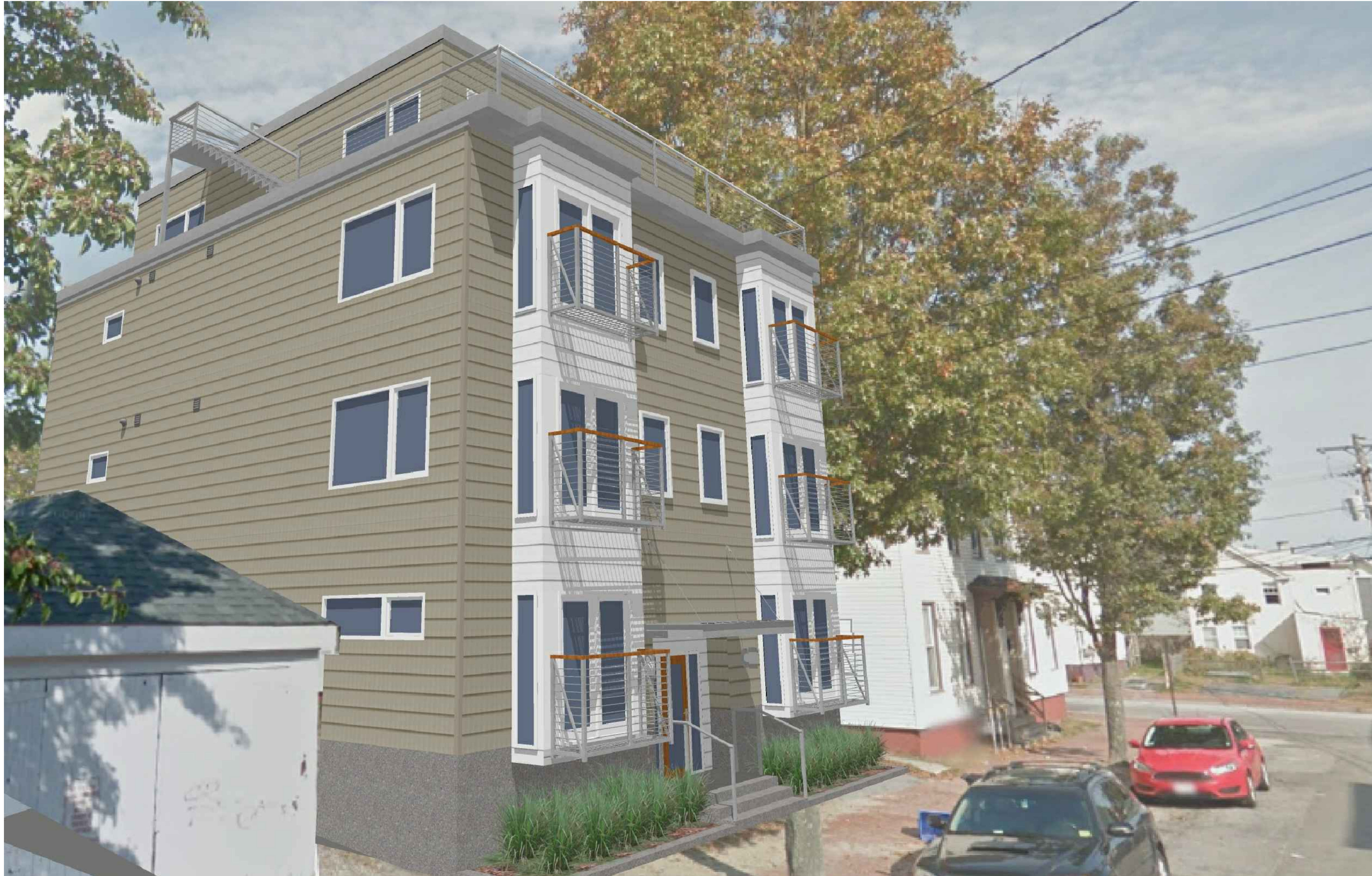
1 RENDERING SCALE: NTS

Bild Architecture PO Box 8235 Portland, ME 04104 207.408.0168 evan@bildarchitecture.com