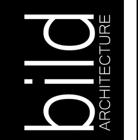
Bild Architecture PO Box 8235 Portland, ME 04104 207.408.0168 evan@bildarchitecture.com