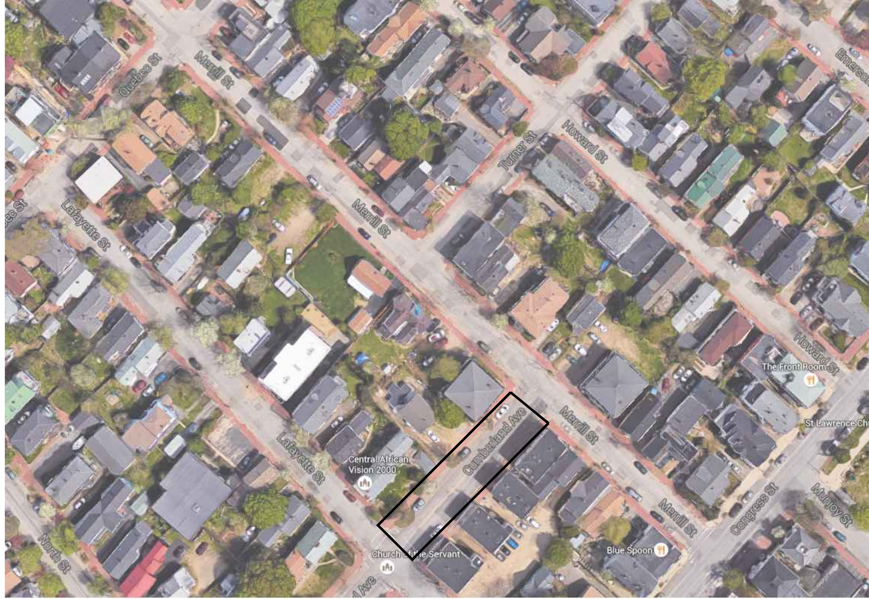
N 5 SITE MAP 0 NTS