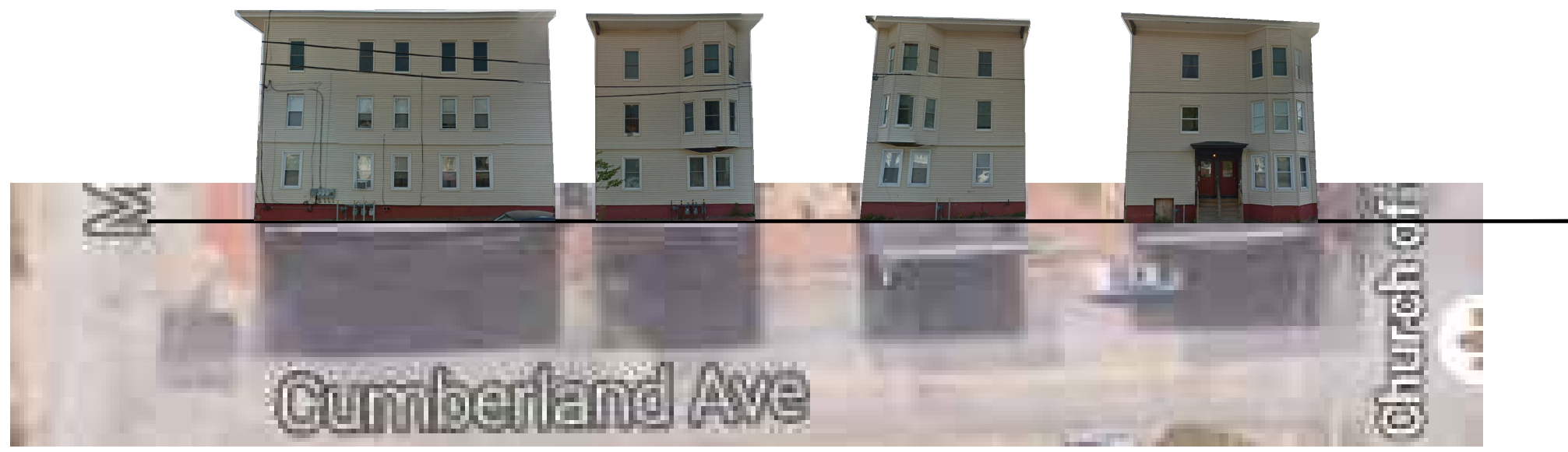
2 CUMBERLAND AVE EAST 0 30'