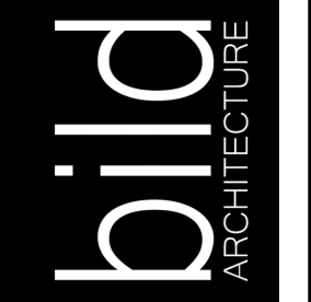
Bild Architecture PO Box 8235 Portland, ME 04104 207.408.0168 evan@bildarchitecture.com