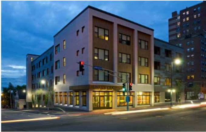
409 Congress Street

The Avesta building at 409 Cumberland, presumably built with minimizing cost forefront in the mind of the developer, is superior in articulation to the 30 Merrill design. And this building sits in a neighborhood of other very large square commercial buildings.