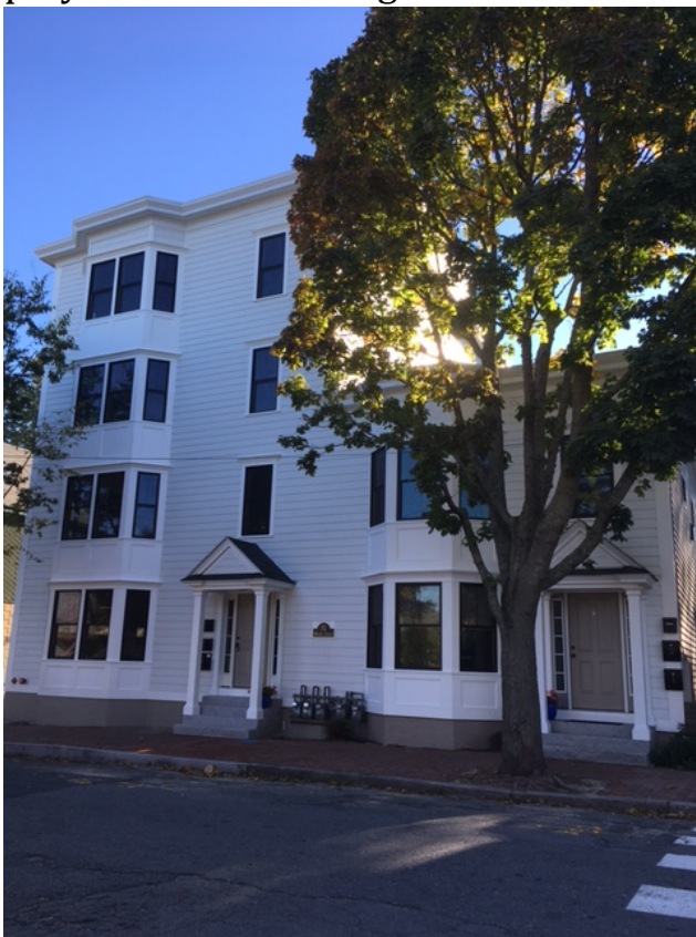
72 Munjoy Street

This building does not in any recognizable way reinforce positive features of the surrounding area. Within the block the unique identity of the large buildings to the south are their bays and cornices and mansard roofs, to the north, for the smaller residence are their gable ends, their bays, window shapes and emphasized entrances. It is not impossible to design a larger building that is sympathetic to an existing neighborhood of smaller residences. An excellent example is the new 5-family building at 72 Munjoy Street. Although it is the largest building on the street it, it does not overwhelm the neighborhood; rather, it adopts numerous of the existing characteristics of its neighborhood and employs them in its design.