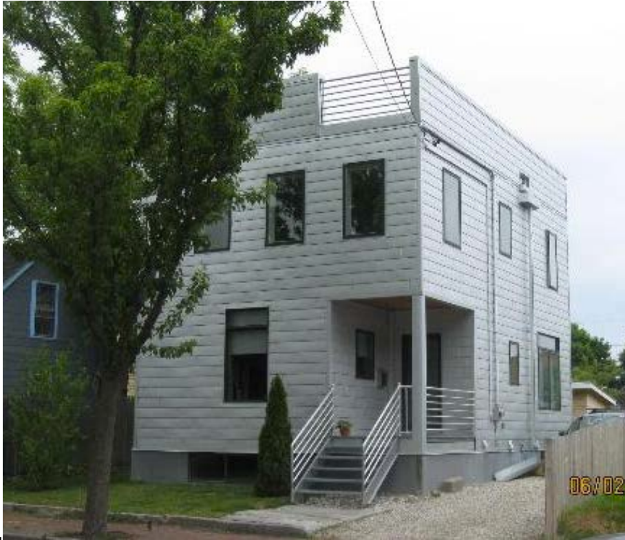
39 Lafayette Street

Furthermore, contemporary architecture is not anathema to the neighborhood. 39 Lafayette a beautifully designed single family home that at 1360 sq. feet is roughly 1/5 th the size of the proposed structure.