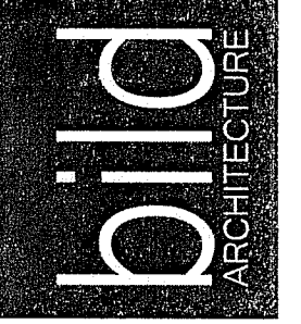
Bild Architecture PO Box 8235 Portland, ME 04107-4088 207.408.0168 evan@bildarchitecture.com

Condominium Documents 30 Lofts Condominium Building Section Land Located at: 30 Merrill Street Portland Maine 04104 Record Owner: Banner Properties LLC Address: 126 Underwood Road Falmouth, Maine 04105