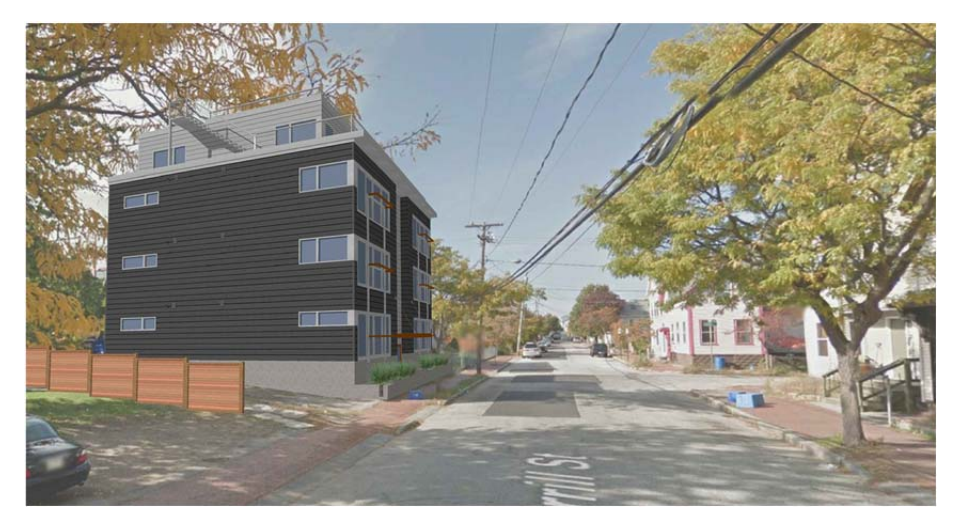
Figures 4, 5, and 6: Renderings of proposed building from north, west, and east.

h. Signage and Wayfinding No signage or wayfinding is proposed.