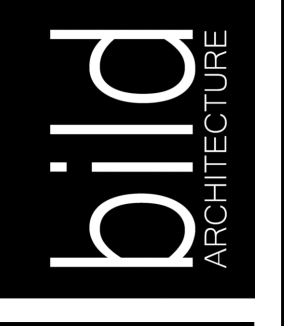
Bild Architecture PO Box 8235 Portland, ME 04104 207.408.0168 evan@bildarchitecture.com