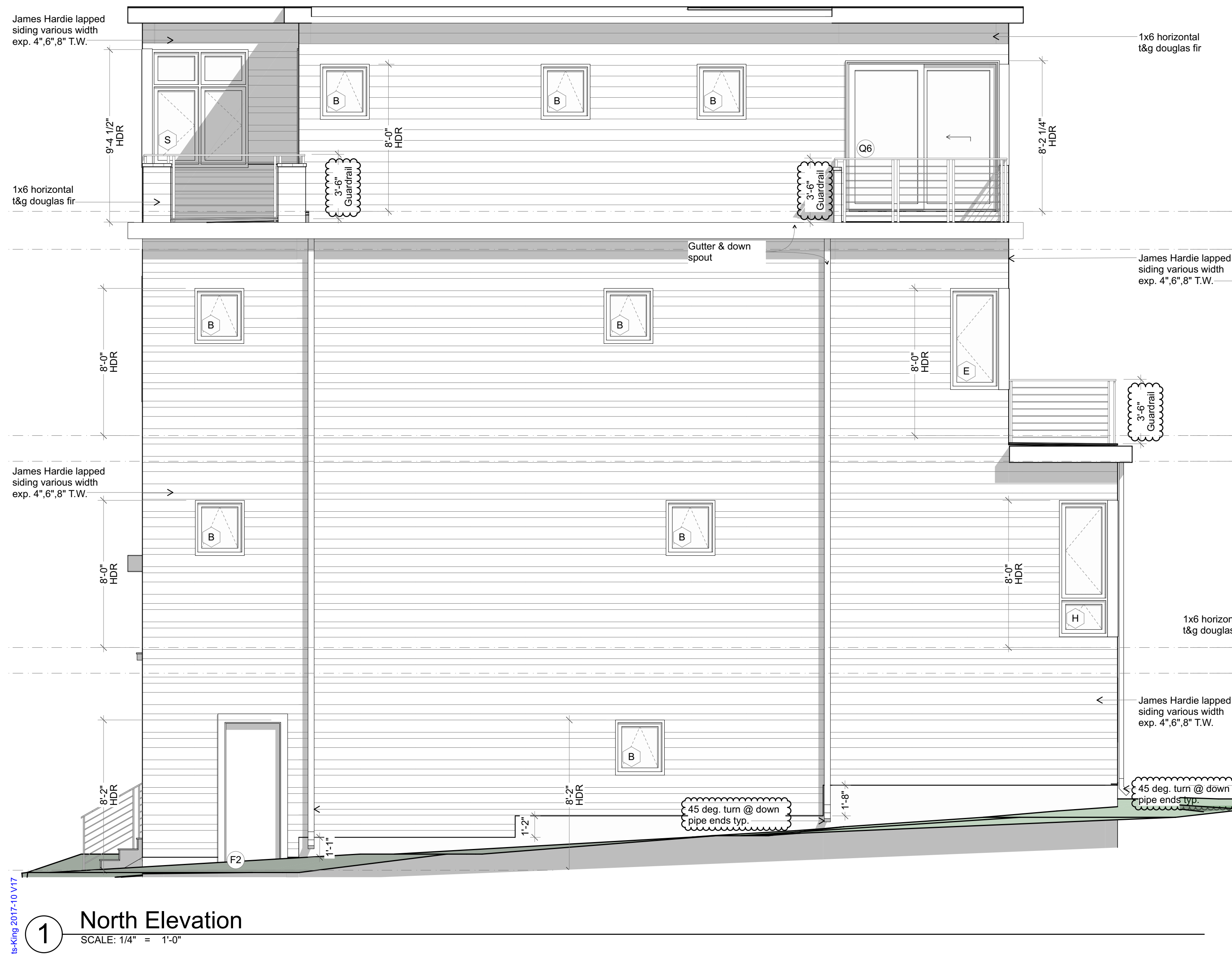
1 North Elevation SCALE: 1/4" = 1'-0"