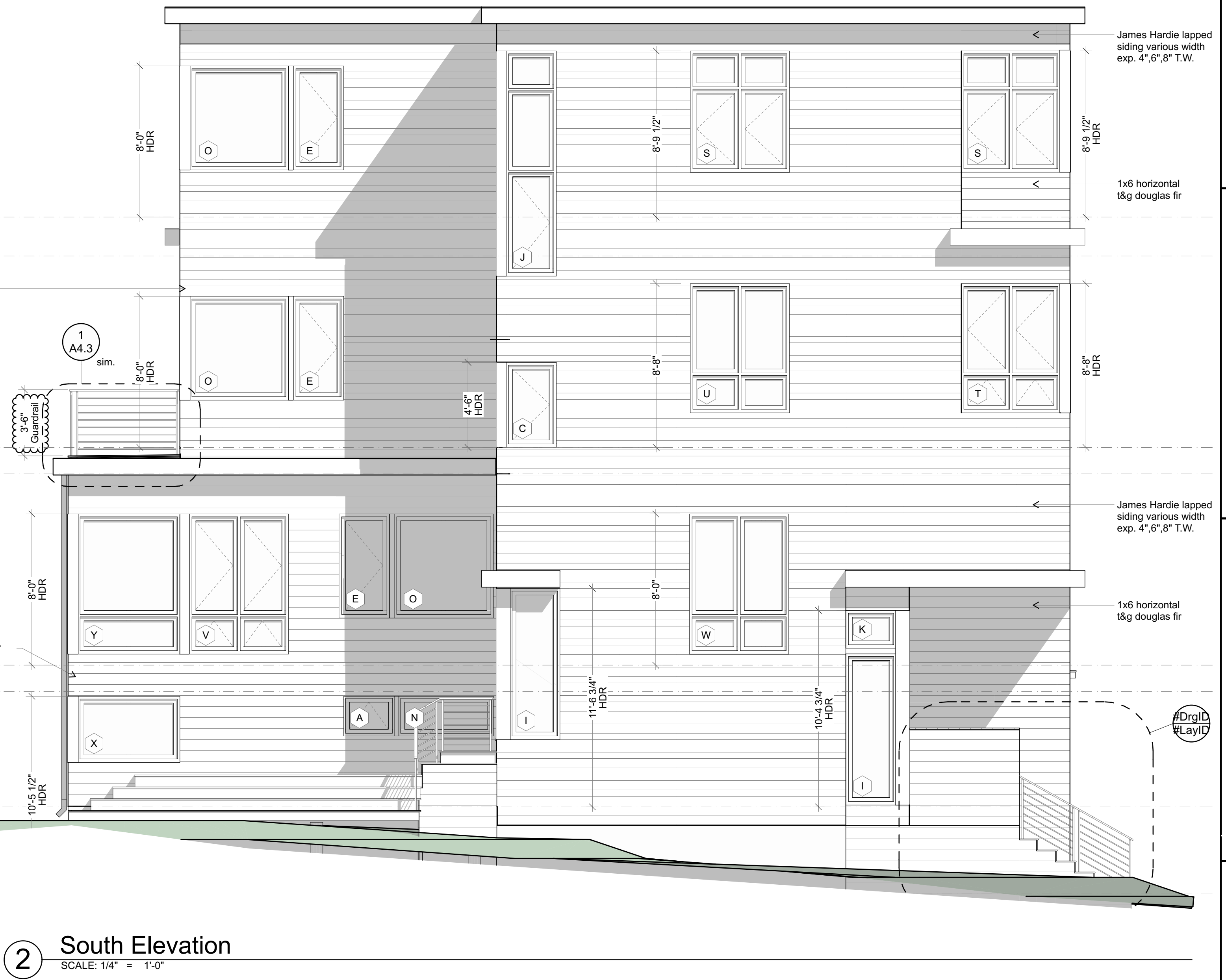
2 South Elevation SCALE: 1/4" = 1'-0"

BIM Server: yoda.kevinbrownearchitecture.com - BIM Server: 20\Clements-King 2017-10 V17