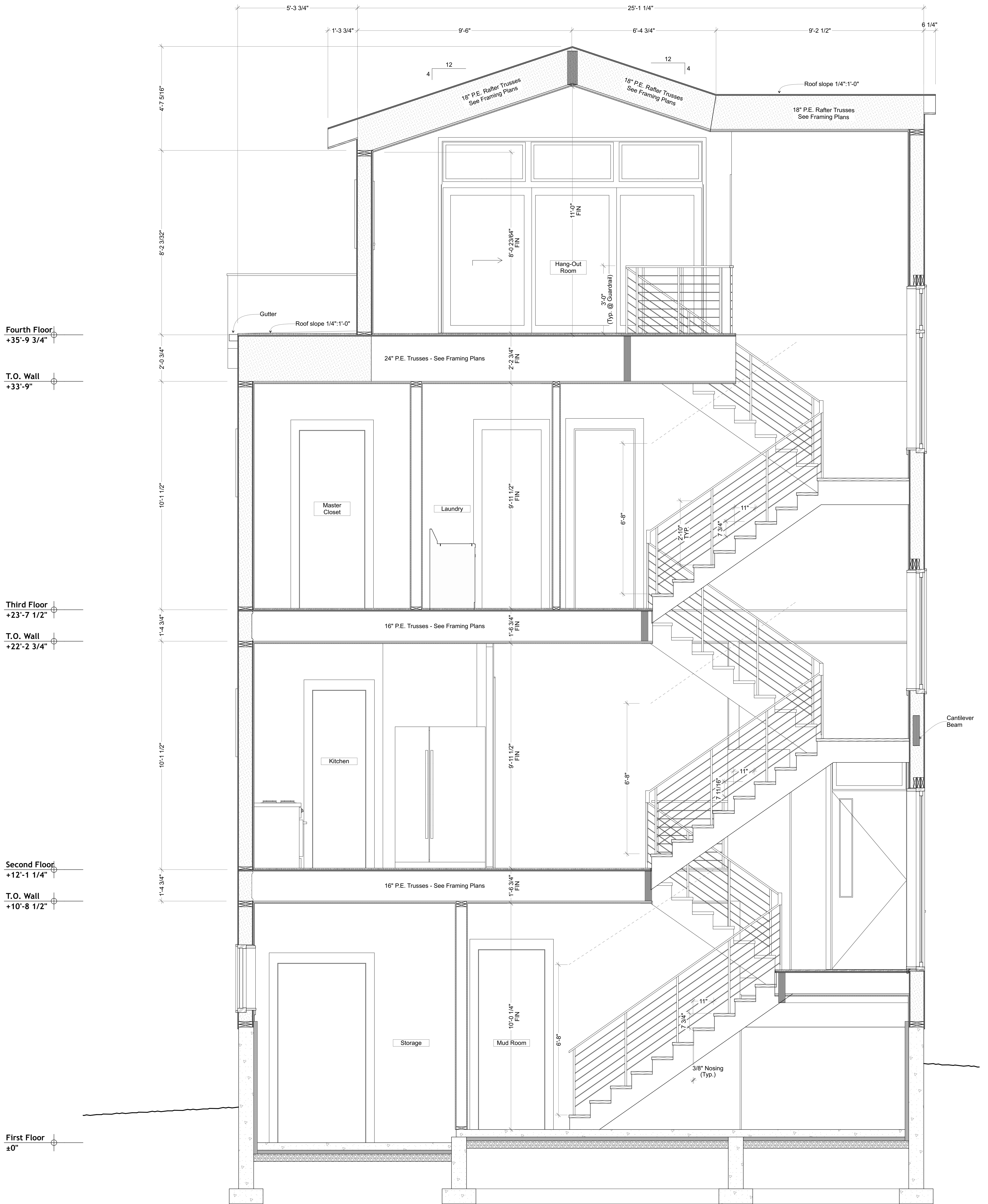
1 Section House N/S