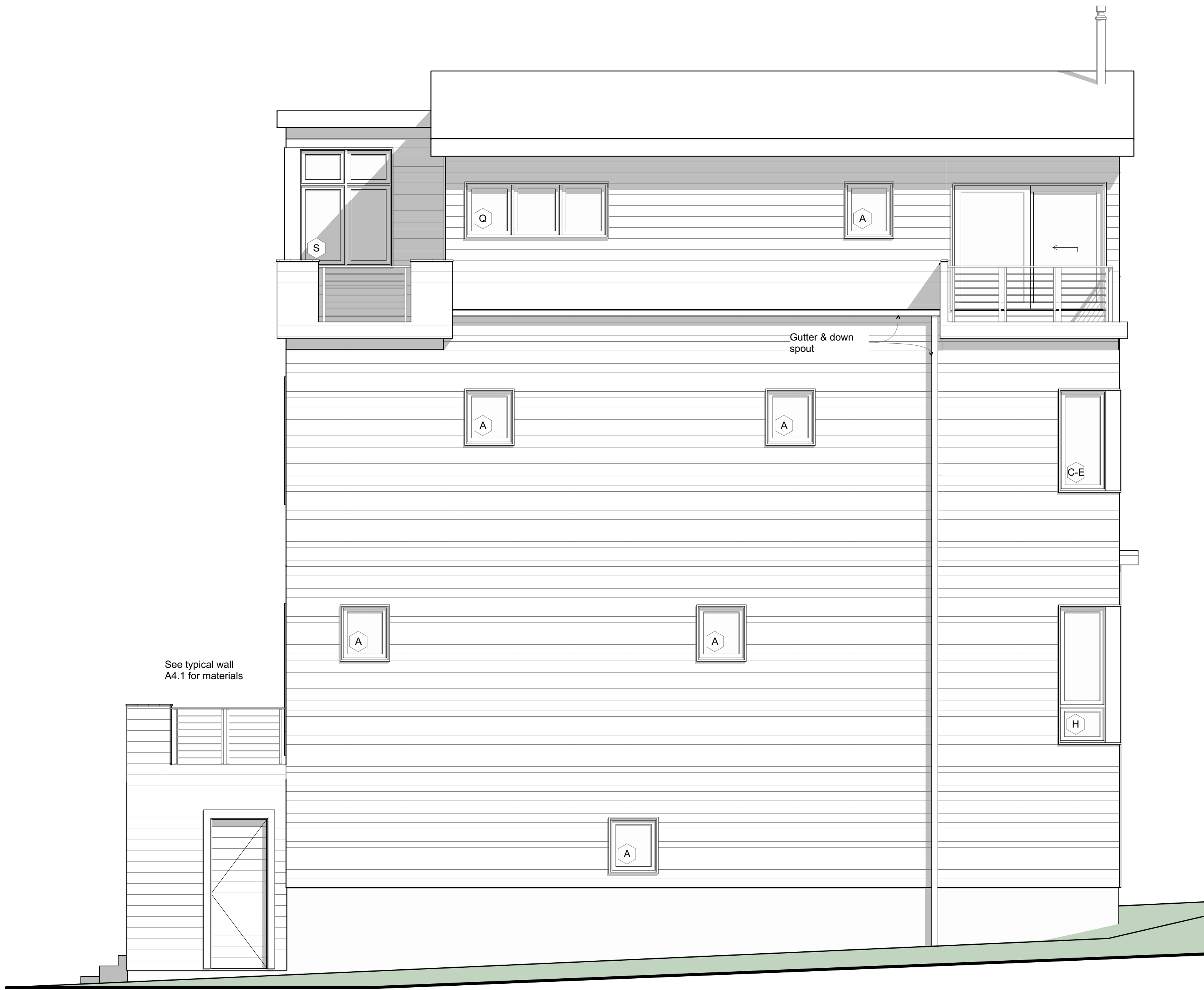
1 North Elevation SCALE: 1/4" = 1'-0"

BIM Server: yoda.kevinbrownearchitecture.com - BIM Server: 20/Clements-King 2017-10 V7