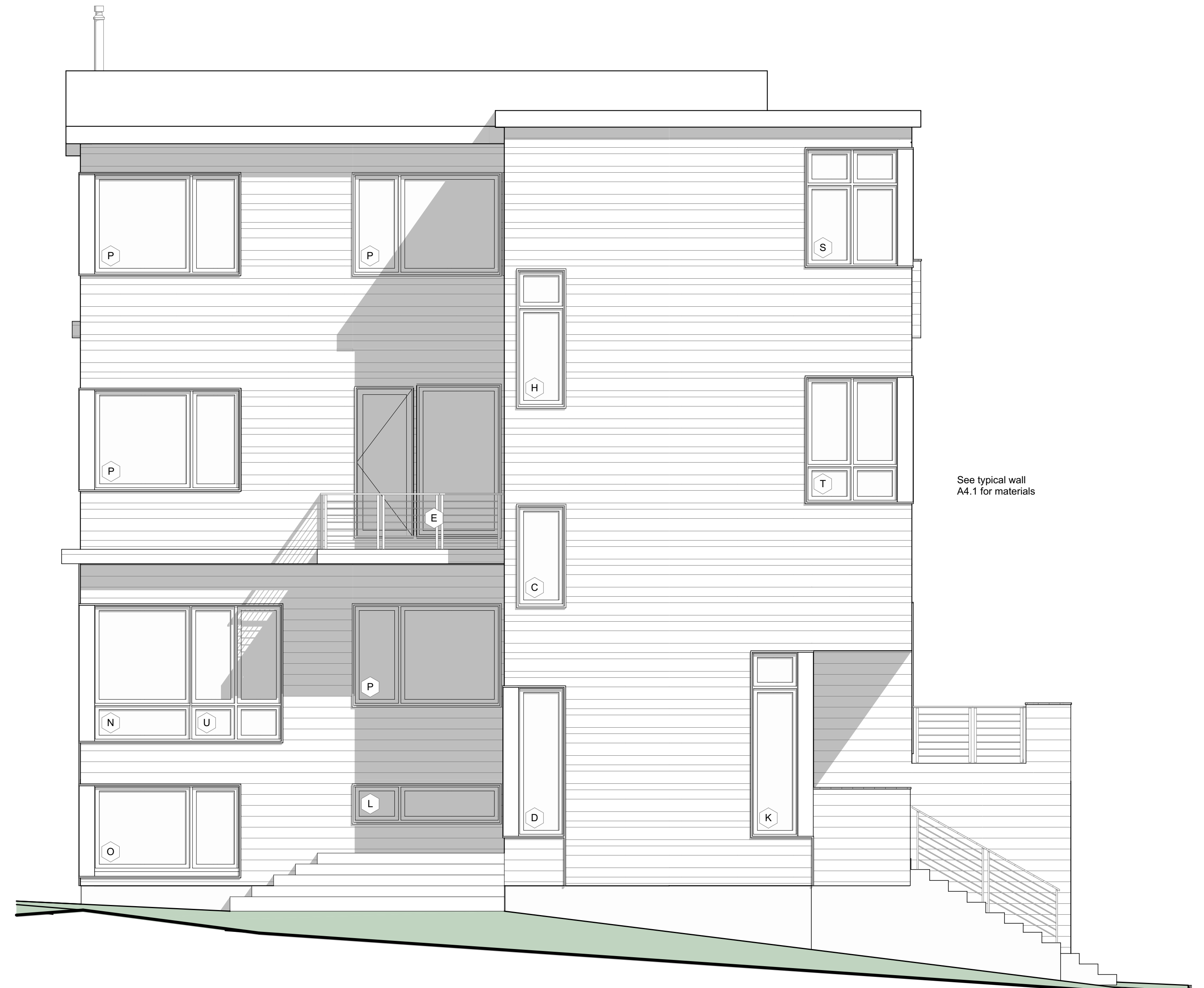
2 South Elevation SCALE: 1/4" = 1'-0"

Contractor shall measure and verify all dimensions at the work. This drawing is a part of a full set of drawings comprising the contract documents for the work of this project. The architect/owner accepts no responsibility for the contractors' errors or omissions if each trade does not have the full set of drawings and specifications