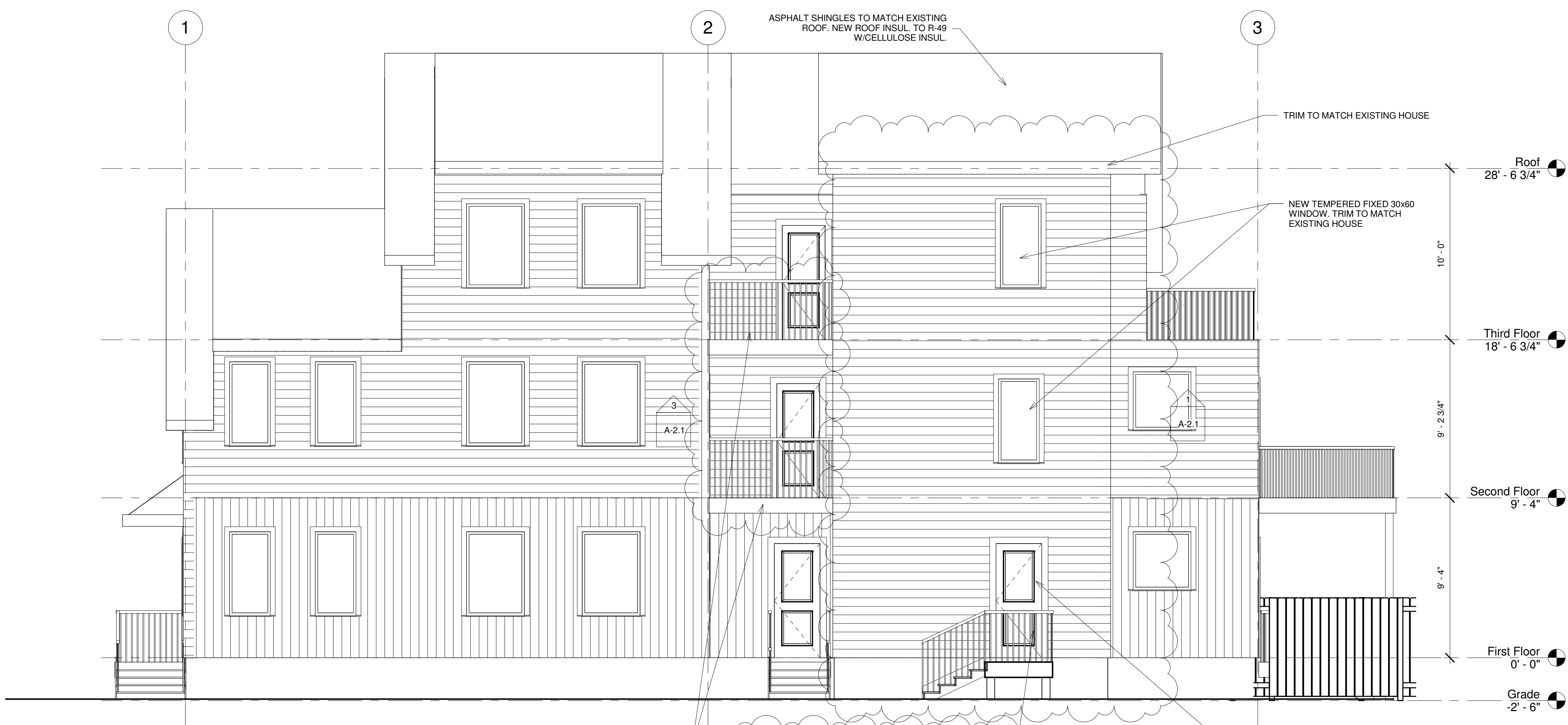
① South 1/4" = 1'-0"

NEW 2x8 PT-FRAMED SPRINKLERED DECKS BTW. EXISTING HOUSE AND ADDITION W/42" AFF RAIL. FRAMING = 2x8 LEDGER W/THRU-BOLTS @ HOUSE @ JOIST HANGERS W/FRAMING @ 16" O.C. & DECK BOARDS ABOVE. TRIM TO MATCH EXISTING HOUSE.