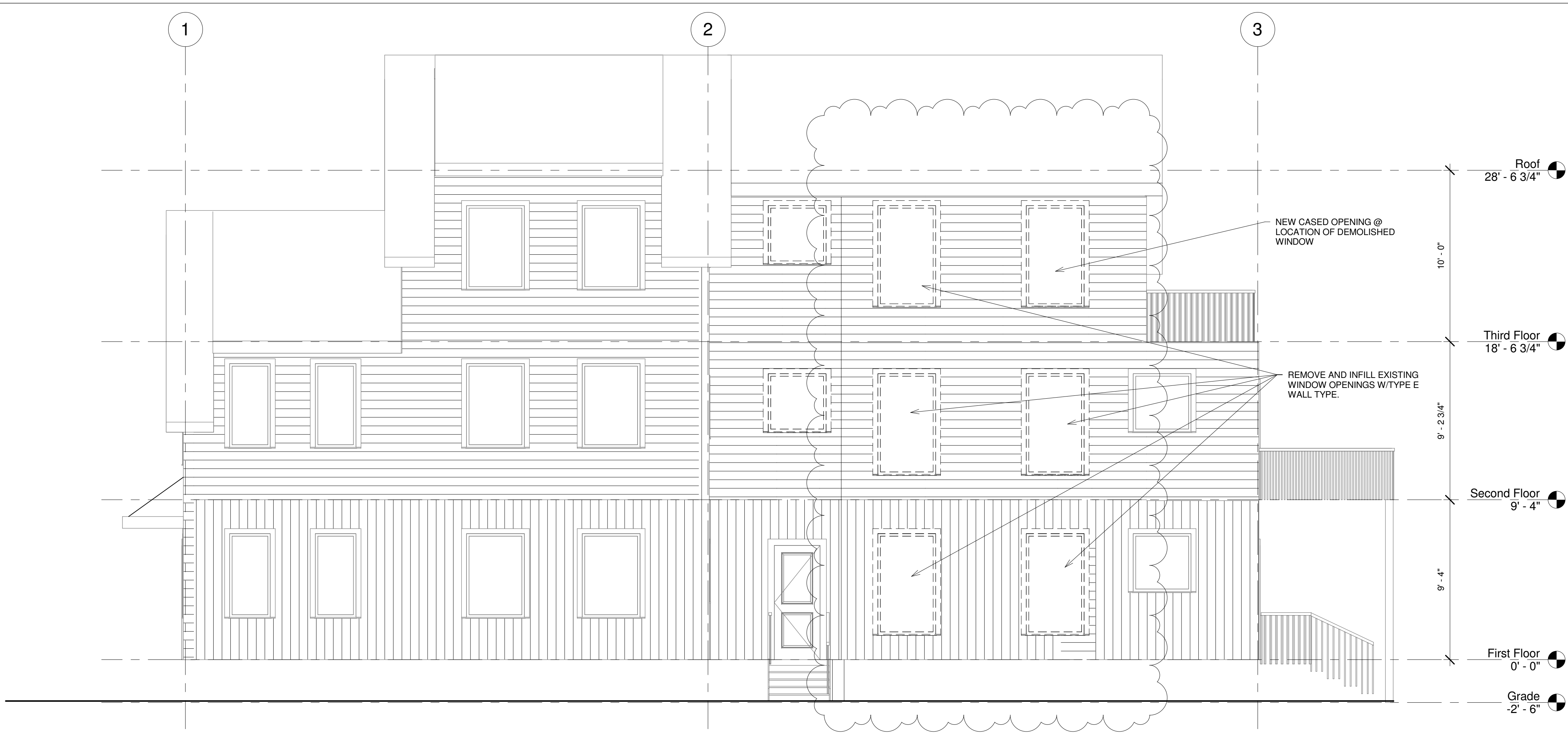
③ South Existing Condition 1/4" = 1'-0"

DEXTRIOUS CREATIVE PORTLAND, ME 04102 TRACIE REED, ARCHITECT NCARB, AIA, LEED AP BD+C traciereed@dextrouscreative.com 207.409.0459 (cell)