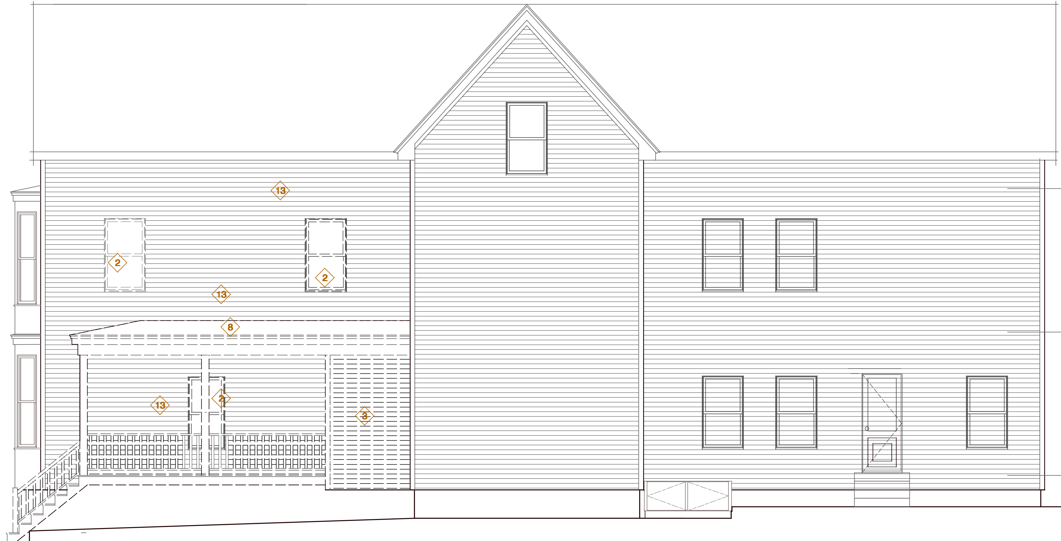
40 East Elevation Demo 0 2 6 12