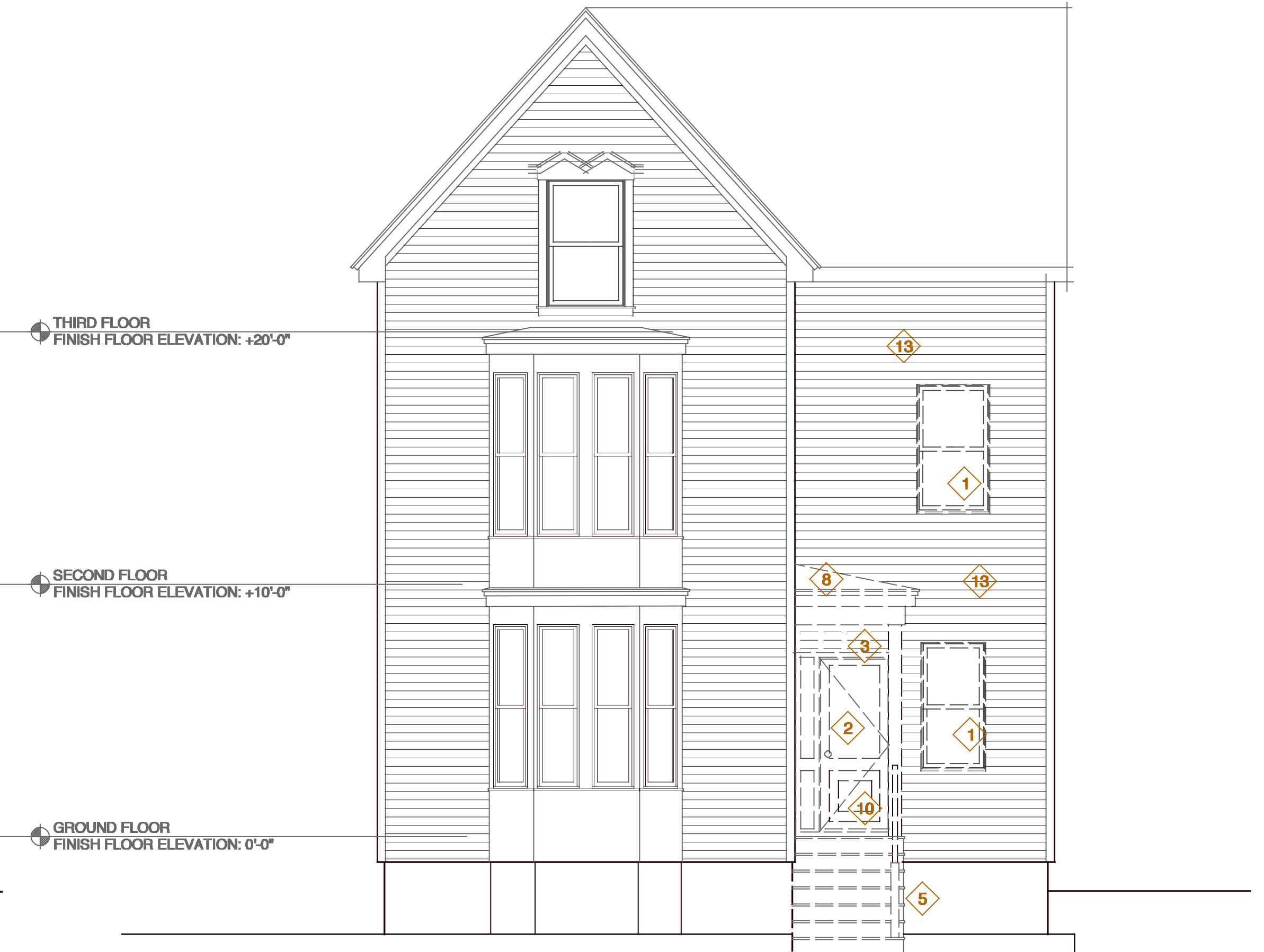
30 South Elevation Demo 0 2 6 12