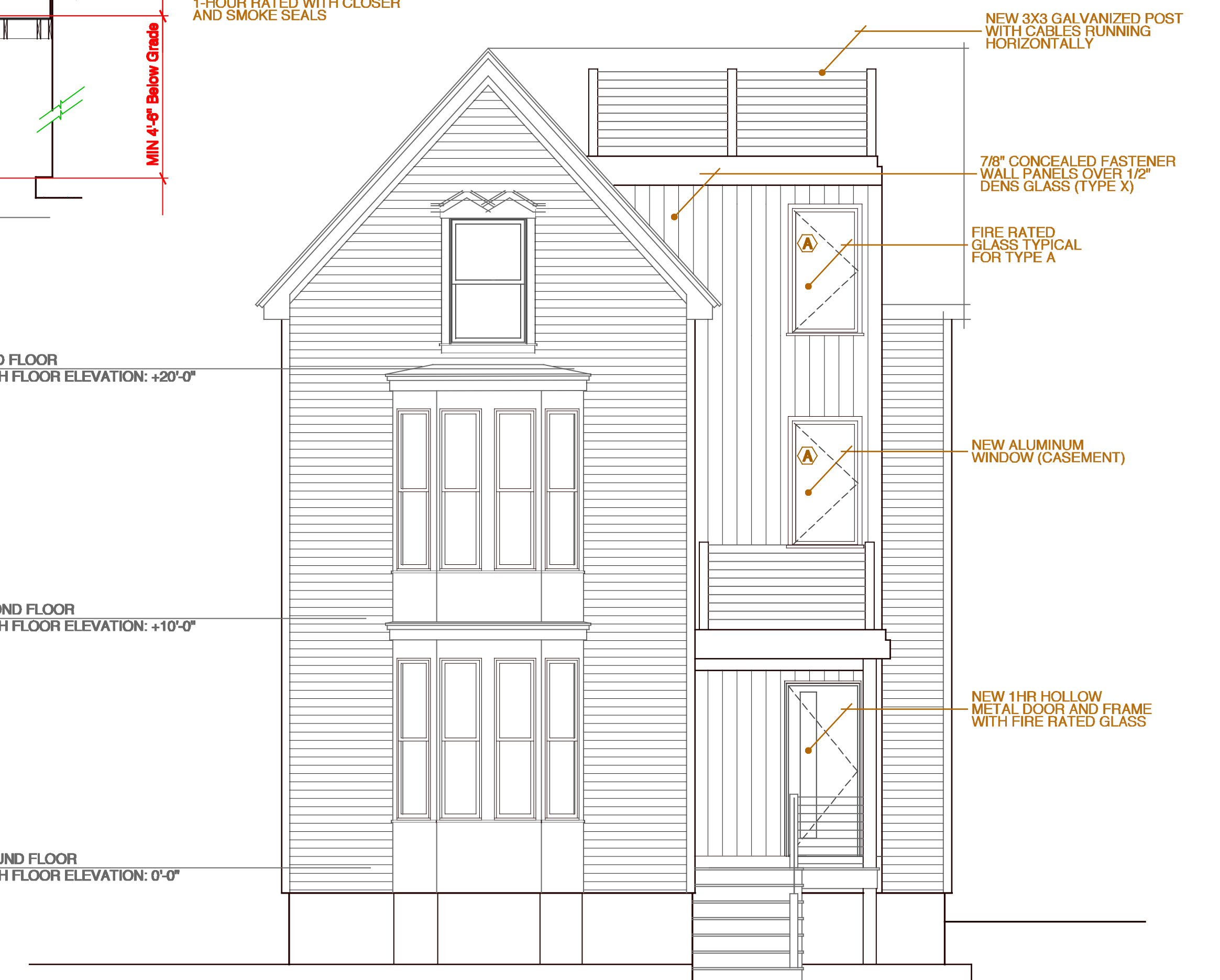
30 South Elevation