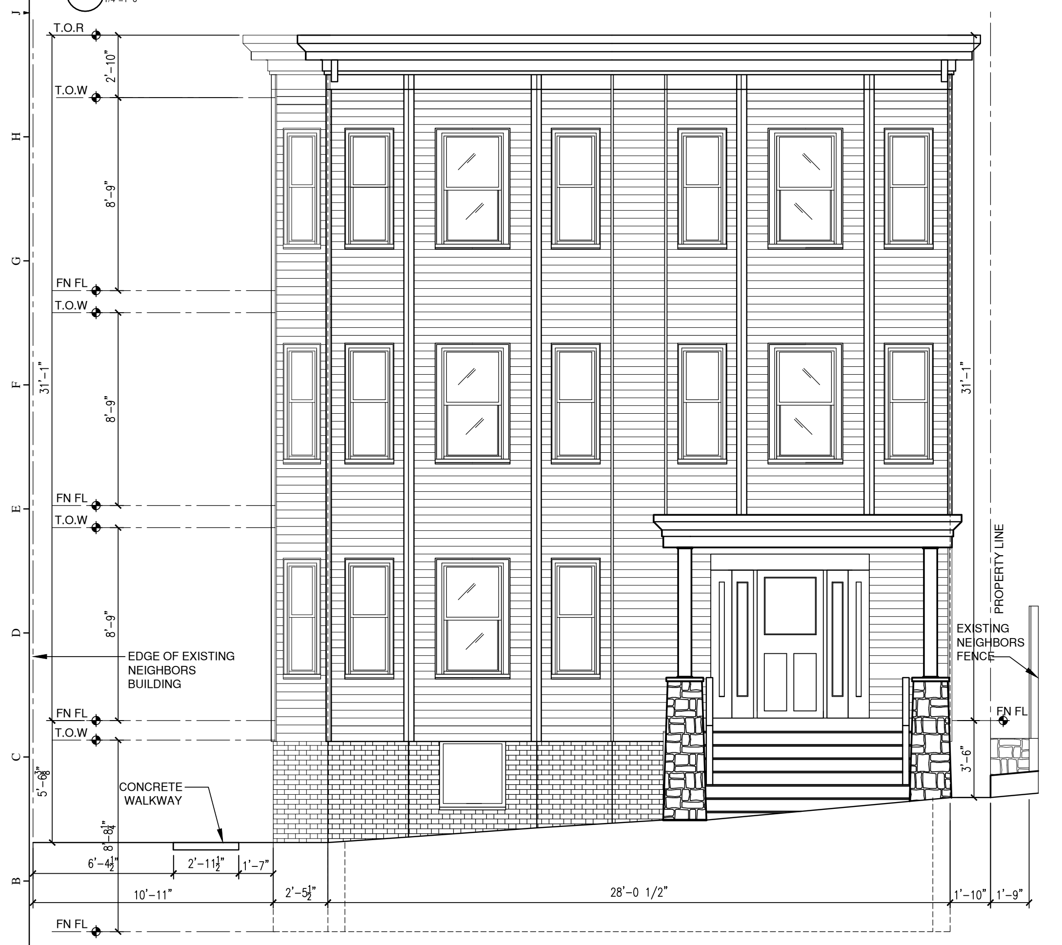
A1 FRONT ELEVATION