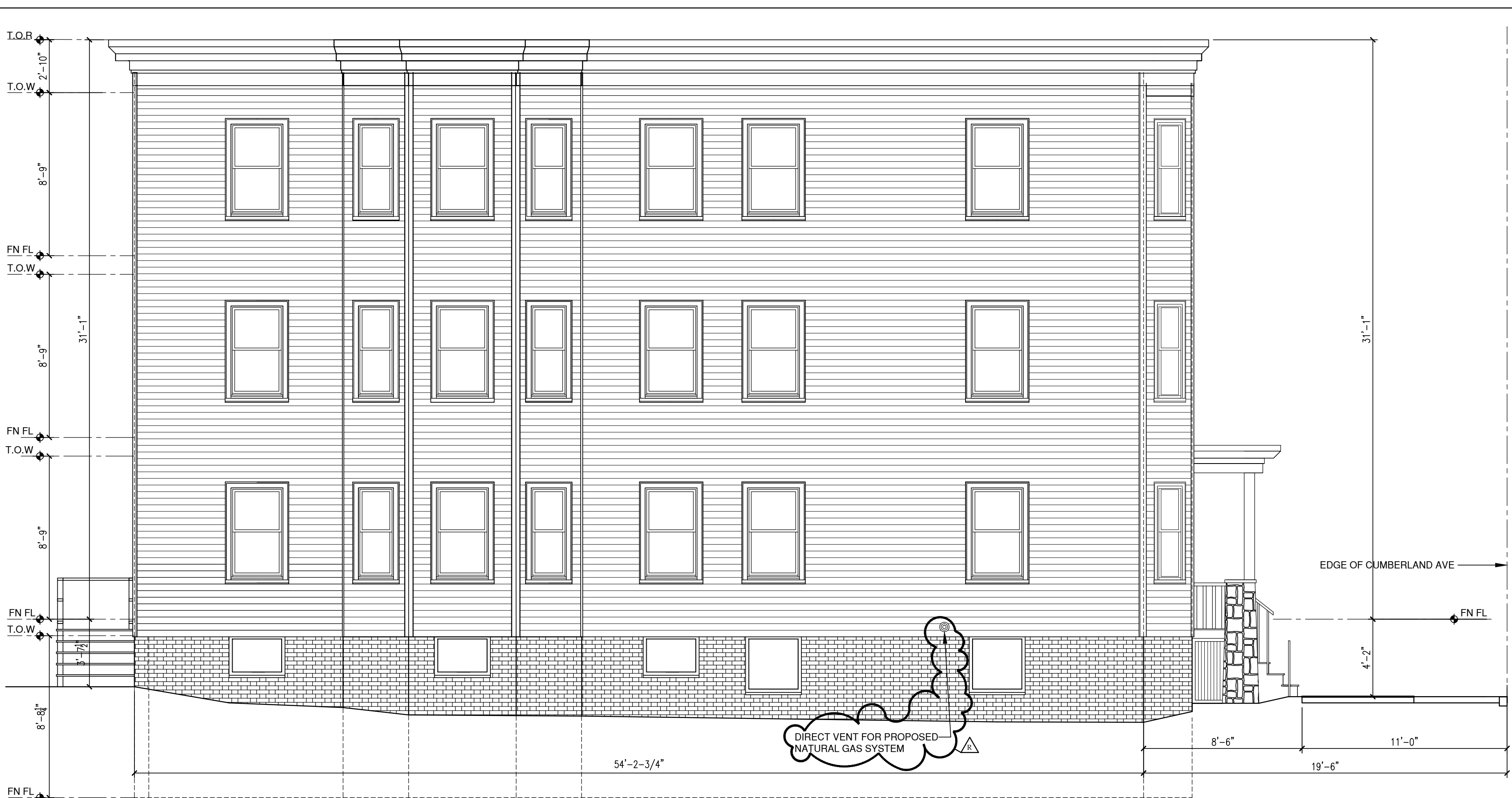
J9 LEFT ELEVATION