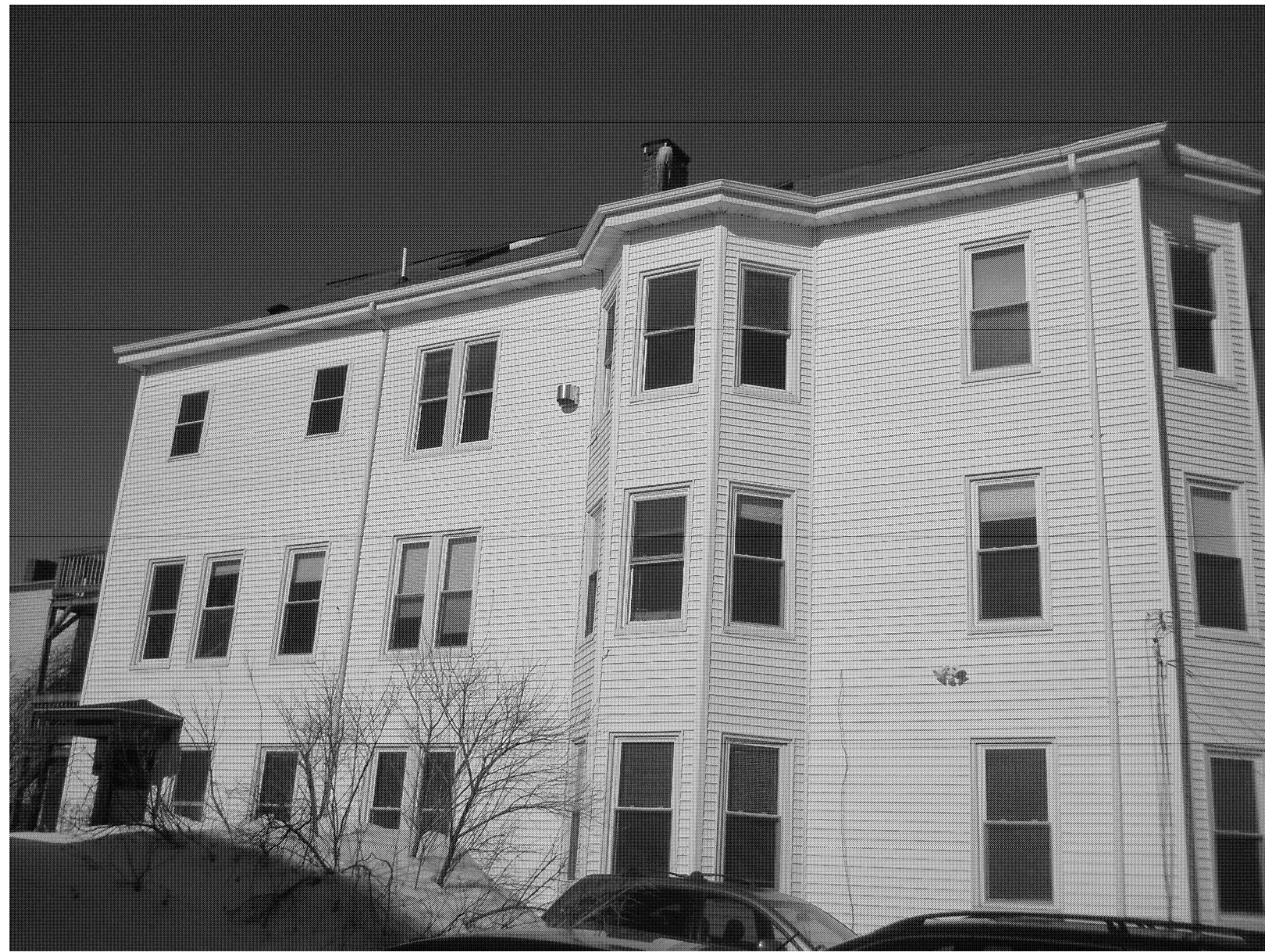
EXISTING PHOTO OF LEFT EYEAVION