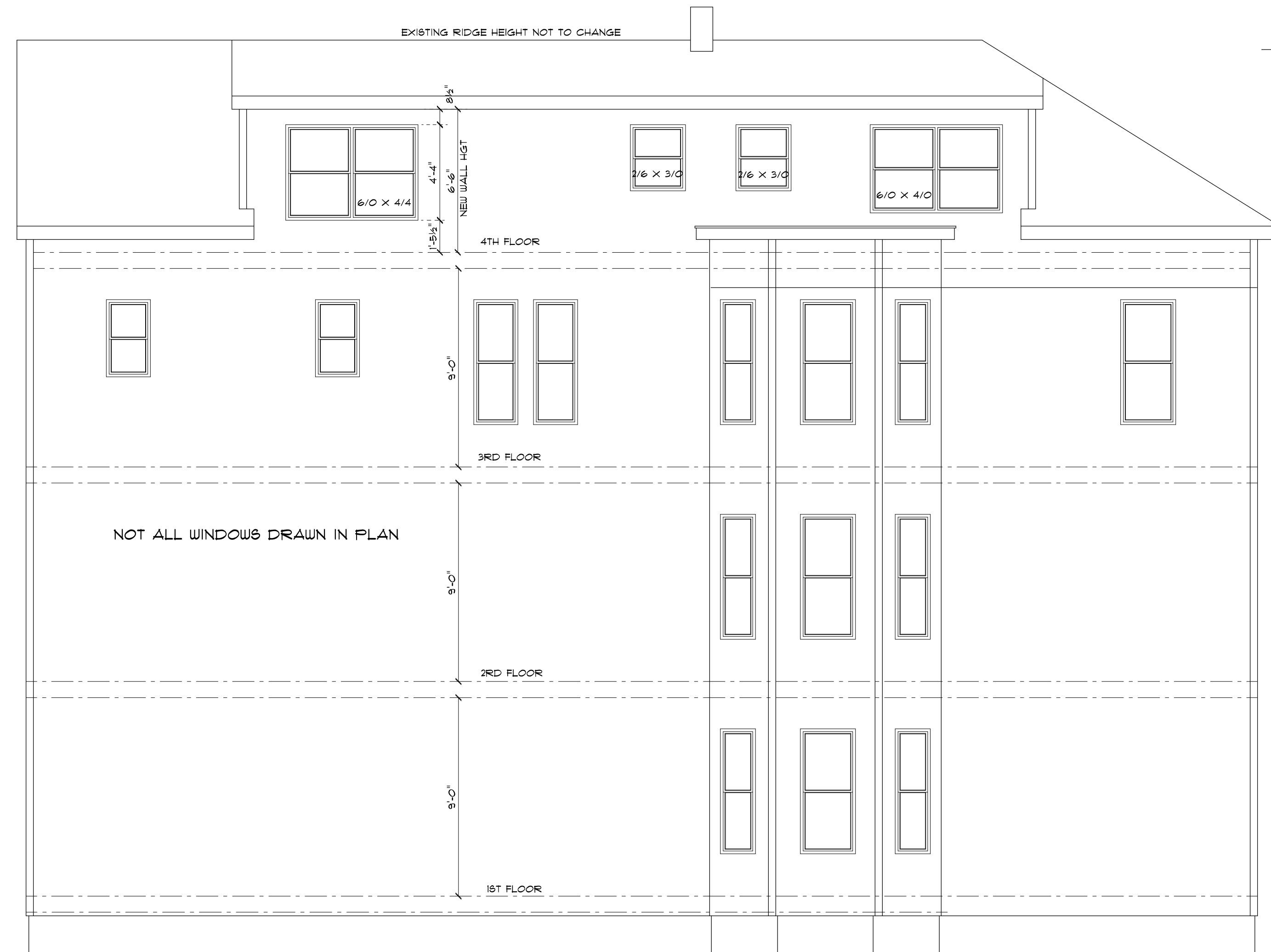
LEFT ELEVATION PROPOSED SCALE: 1/4" = 1'-0"

ALL PLANS/DRAWINGS THAT ARE PROVIDED TO THE CLIENTS ARE BASED INFORMATION GIVEN BY THE CLIENT. ALL DIMENSIONS AND SPECIFICATIONS MUST BE VERIFIED BY CLIENT/CONTRACTOR BEFORE CONSTRUCTION BEGINS. OWNER AND CONTRACTOR RESPONSIBLE FOR ANY ERRORS AND OMISSIONS. CONTRACTOR ASSUMES ALL LIABILITY FOR BUILDING CONSTRUCTION. PLANS AND SPECIFICATIONS HAVE NOT BEEN PREPARED BY REGISTERED ARCHITECT OR ENGINEER. CUSTOMER SHOULD CONSULT A REGISTERED ARCHITECT OR ENGINEER OF THEIR CHOICE IF ARCHITECT OR ENGINEER STAFF IS NECESSARY BEFORE CONSTRUCTION BEGINS. ALL CONTRACTORS TO CONFORM TO ALL STATE AND LOCAL BUILDING CODES.