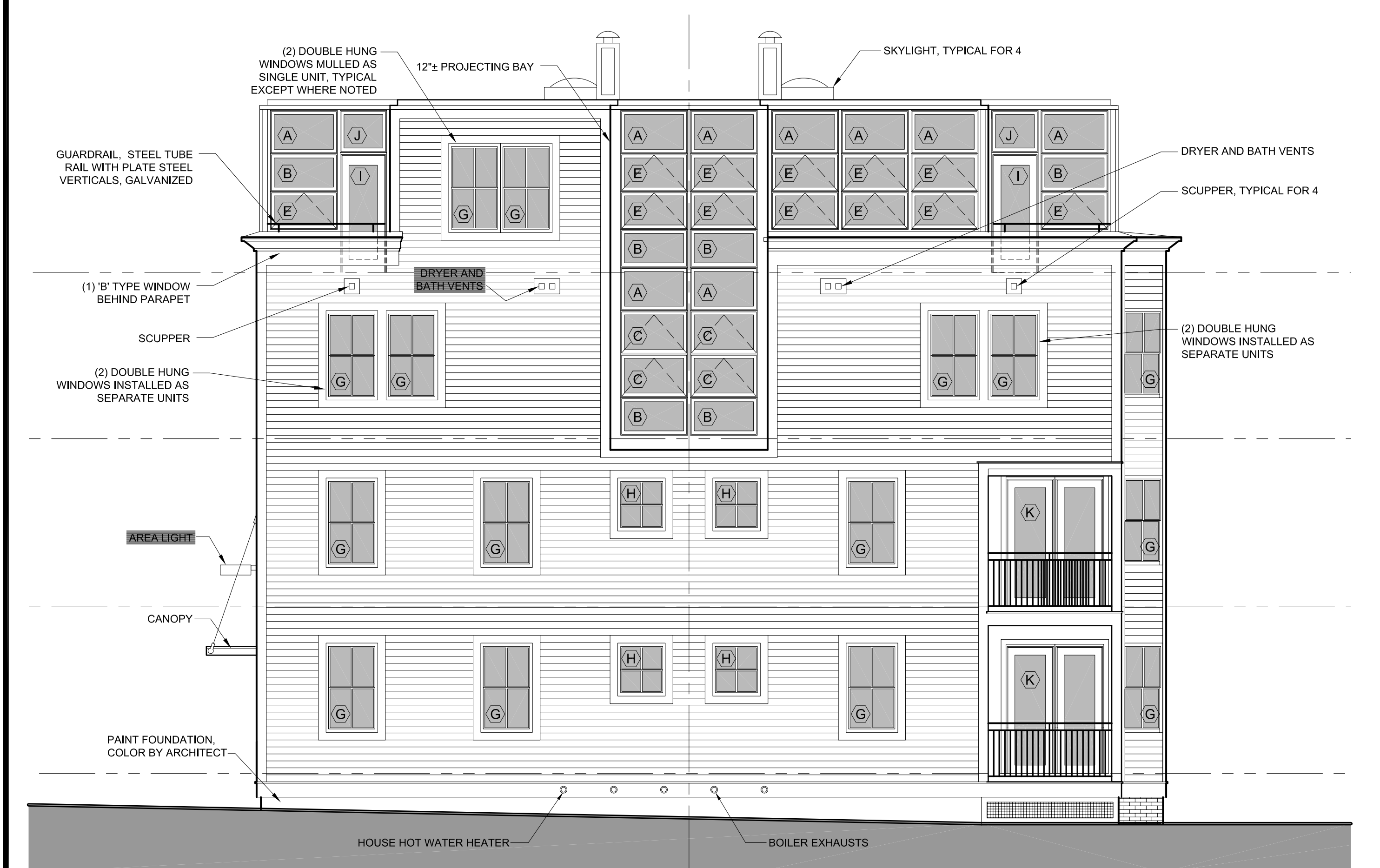
2 LEFT SIDE (NORTH) ELEVATION A2-1 SCALE: 3/16" = 1'-0"