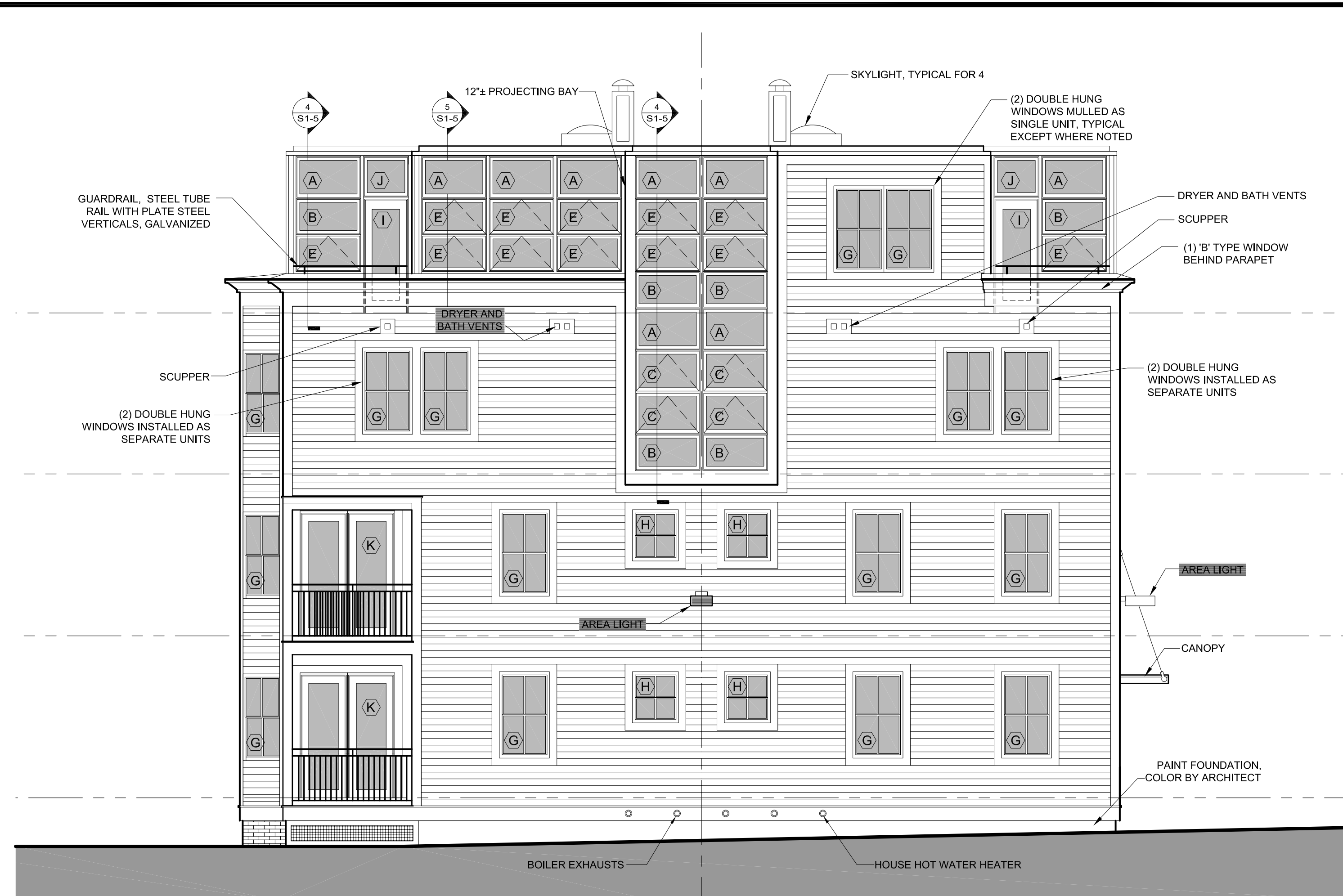
4 RIGHT SIDE (SOUTH) ELEVATION A2-1 SCALE: 3/16" = 1'-0"