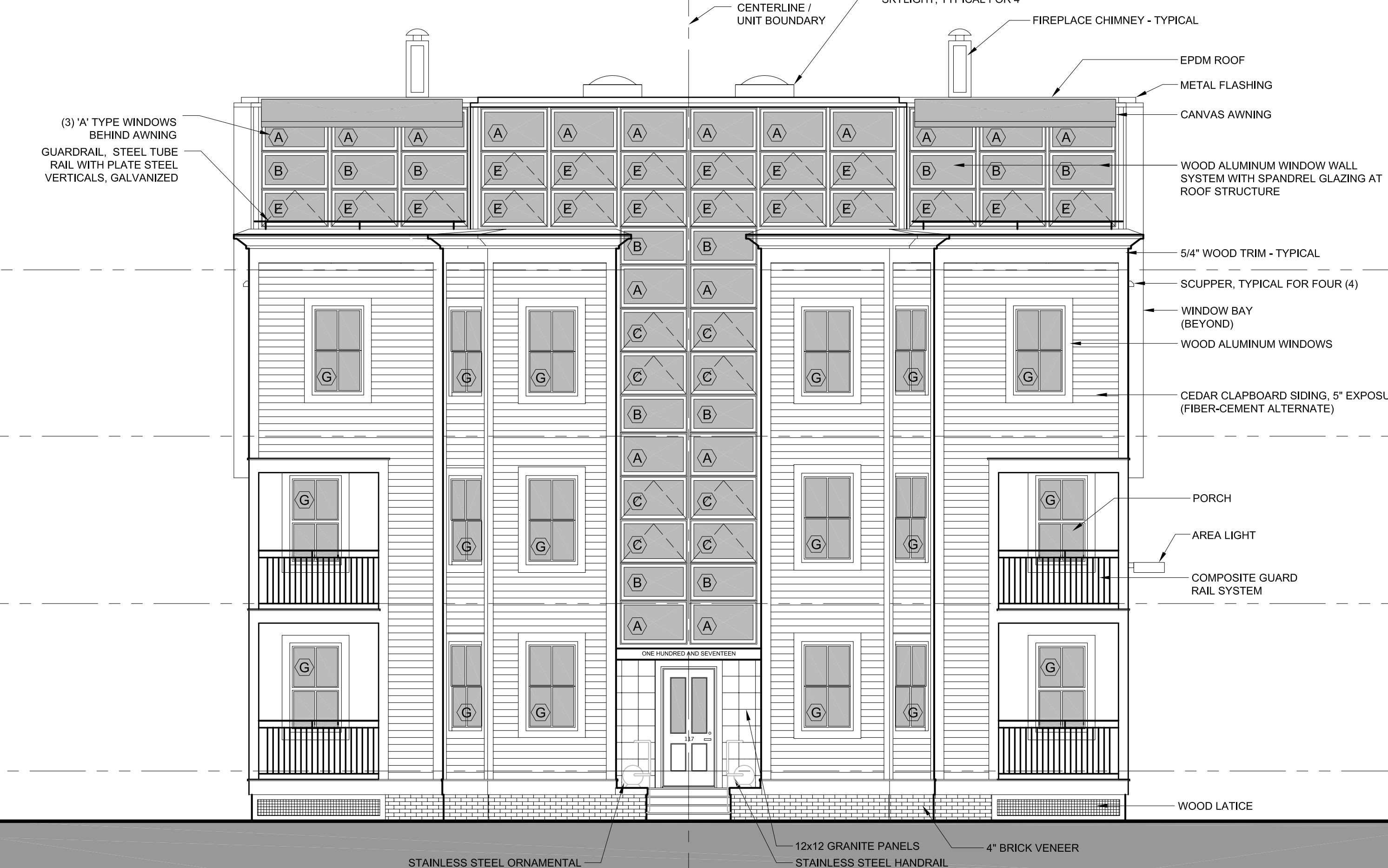
1 FRONT (WEST - SHERIDAN STREET) ELEVATION A2-1 SCALE: 3/16" = 1'-0"