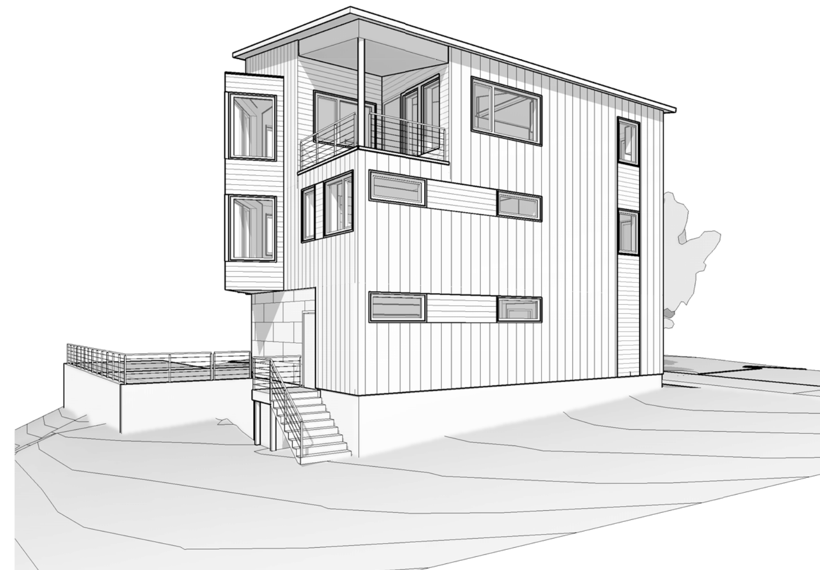
② SOUTHWEST VIEW