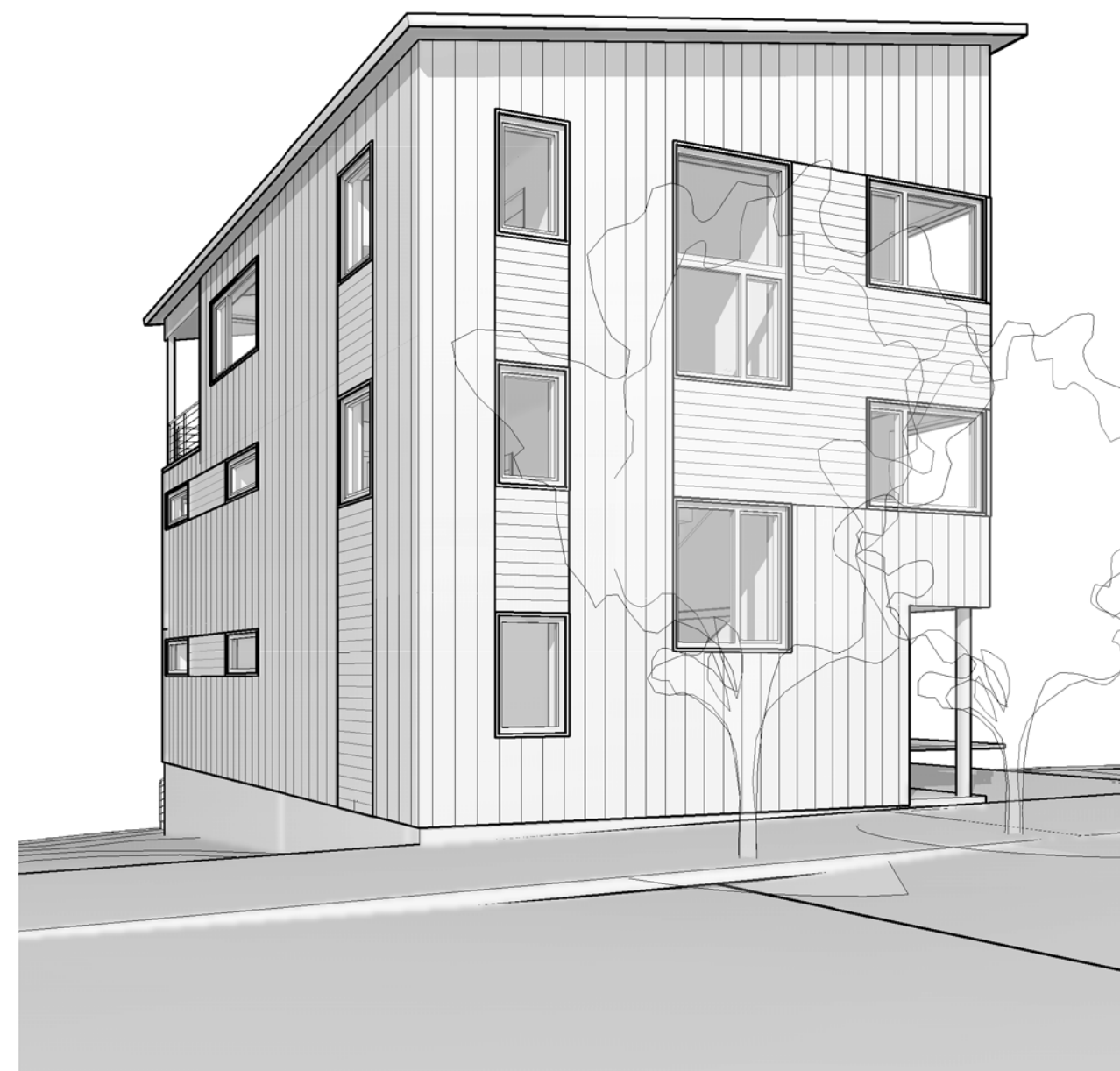
① SOUTHEAST VIEW

BRI BURN architecture for life 20 Maple St Suite 201 Portland, ME 04101 207-774-9462