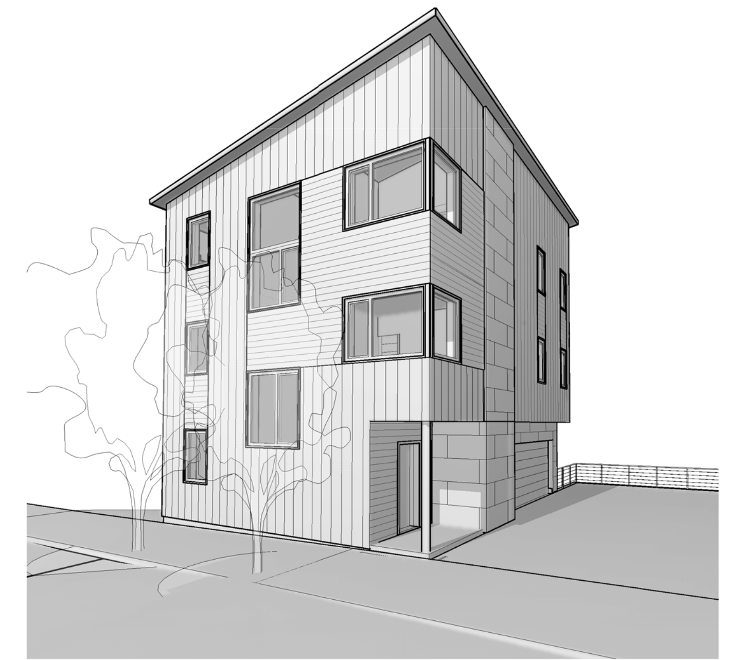
④ NORTHEAST VIEW