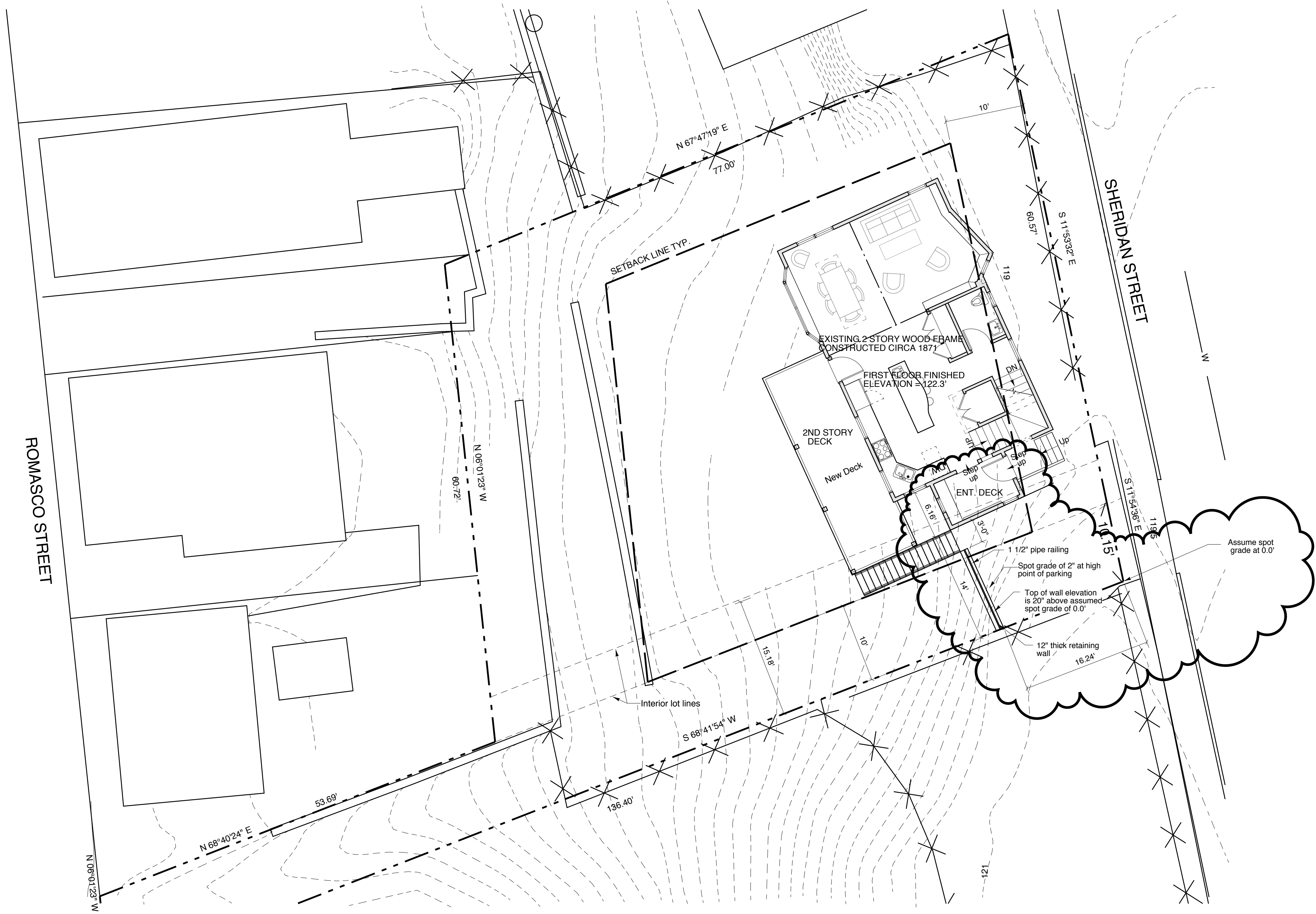
1 Site Plan Scale: 1/8"=1'-0"