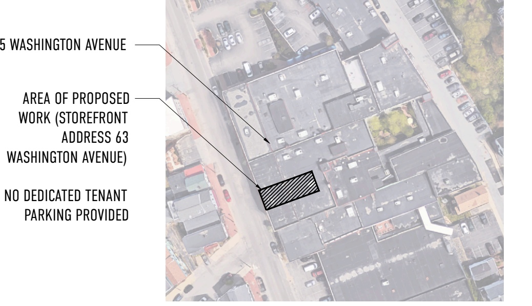
2 KEY PLAN SCALE: NTS

CODE SUMMARY: APPLICABLE CODES INTERNATIONAL BUILDING CODE 2009 EDITION NFPA 101 2009 EDITION TOTAL EXISTING TENANT AREA = 1,253 SF OCCUPANCY CLASSIFICATION (IBC SEC 304, 306) SECTION 304, BUSINESS GROUP B: PROFESSIONAL SERVICES/OFFICE: OCCUPANCY LOAD 100 GROSS (TABLE 1004.1.1) OCCUPANCY LOAD (IBC TABLE 1004.1.1, NFPA) OCCUPANCY = 12 AUTOMATIC SPRINKLER SYSTEM EXISTING TO REMAIN - PROTECTED THROUGHOUT REQUIRED OCCUPANCY SEPARATIONS (IBC TABLE 508.4) EXISTING B TO B TO REMAIN