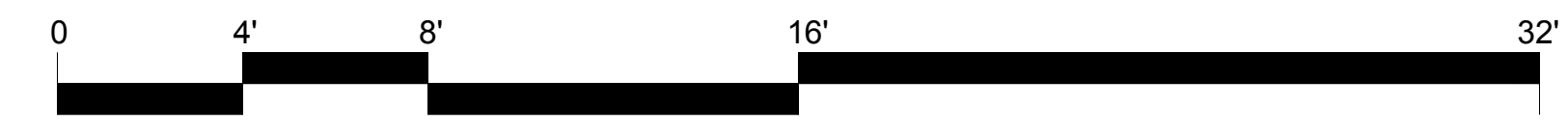
1 FIRST FLOOR REFLECTED CEILING PLAN 1/4" = 1'-0"