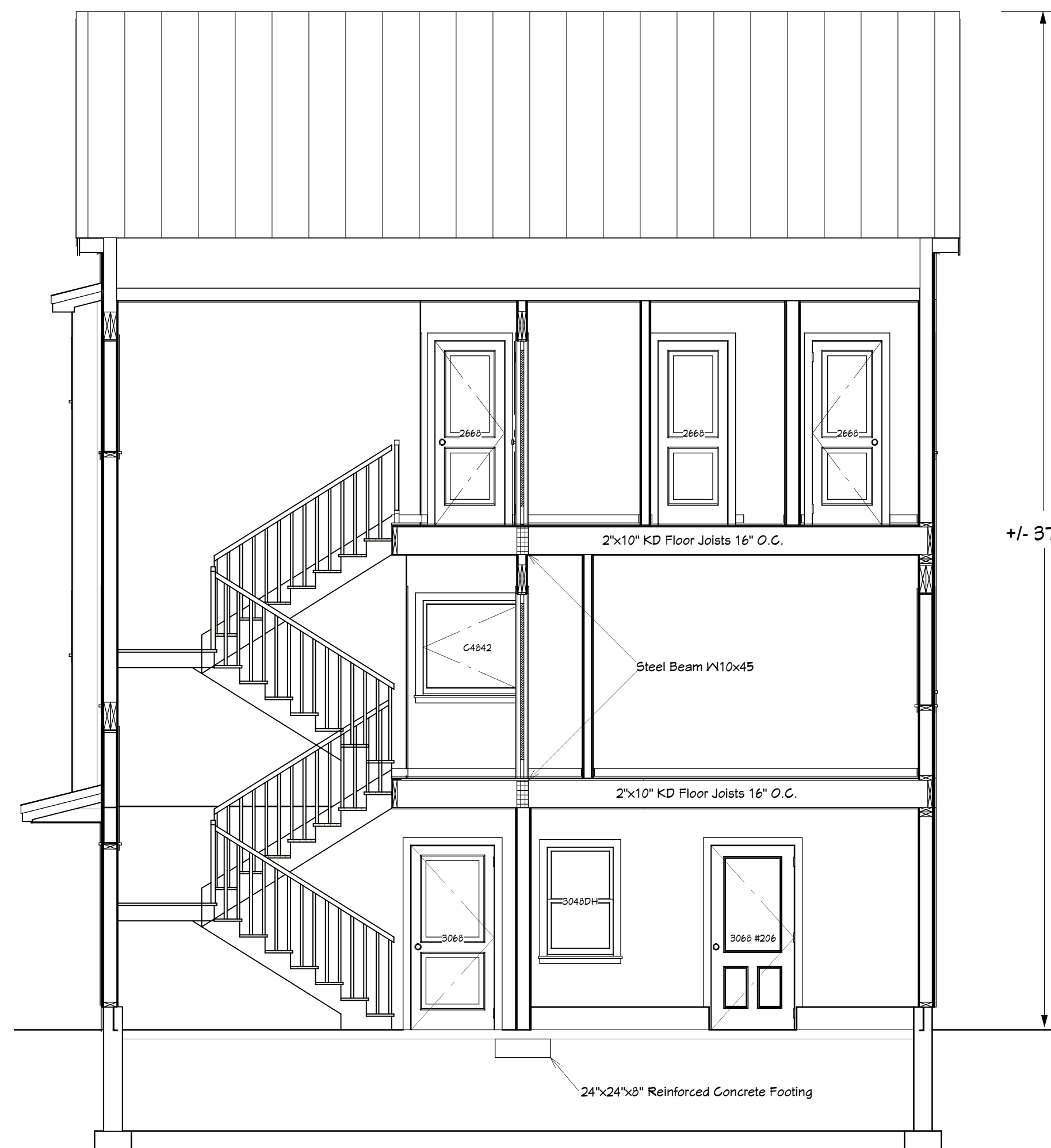
South West Section 1/4 in = 1 ft