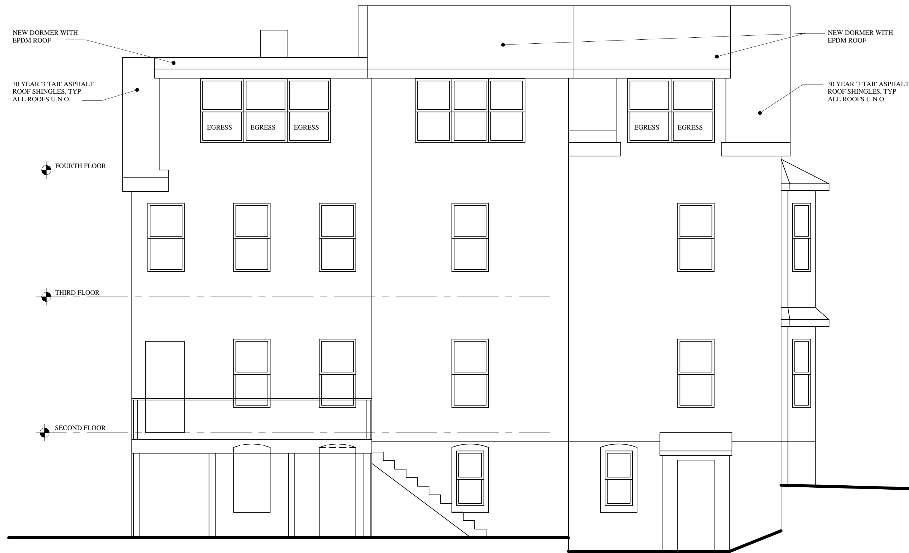
SIDE ELEVATION SCALE: 1/4"=1'-0"

Revised: Nov. 11, 2014 Permit set: Oct. 6, 2014