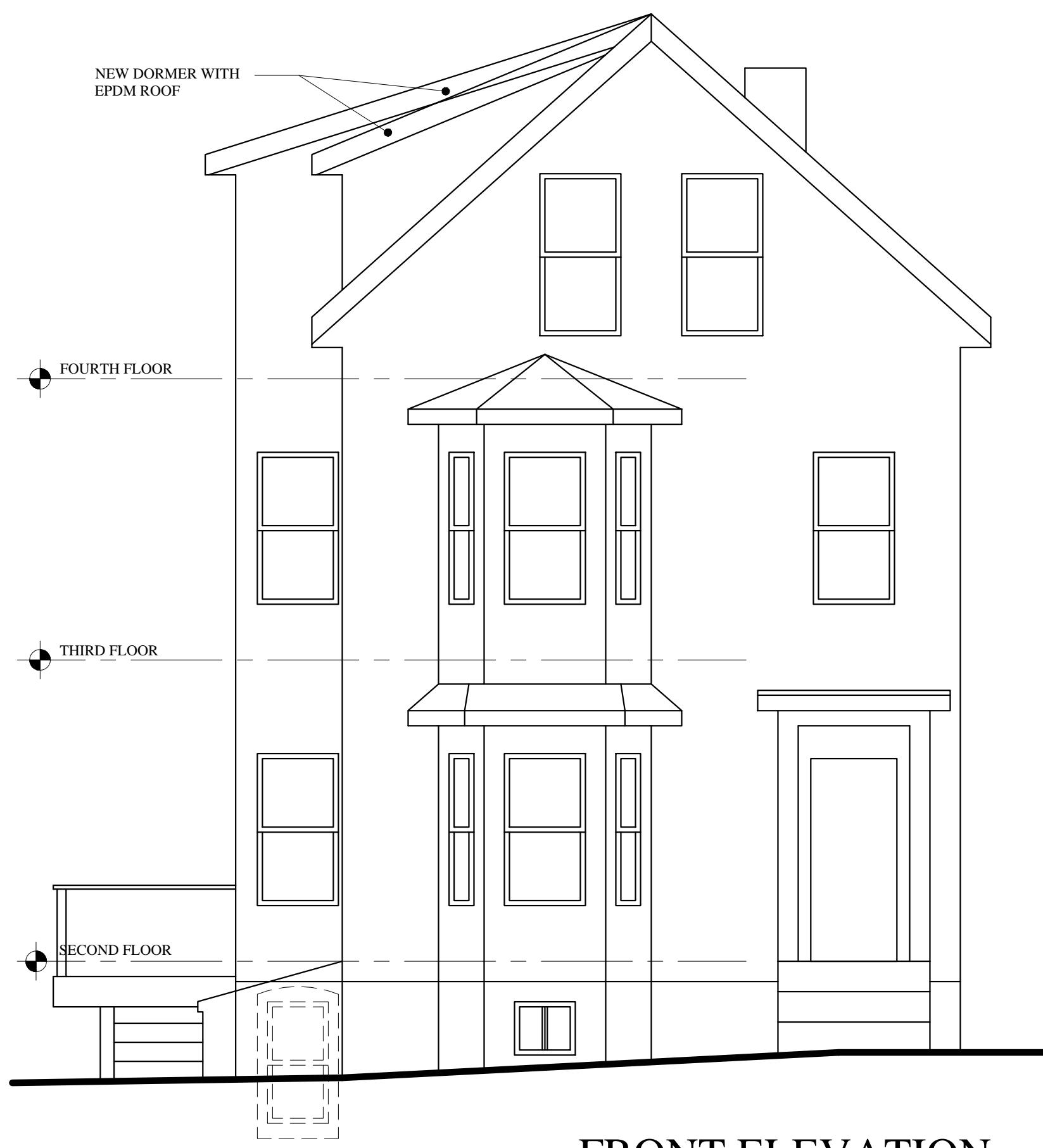
FRONT ELEVATION SCALE: 1/4"=1'-0"