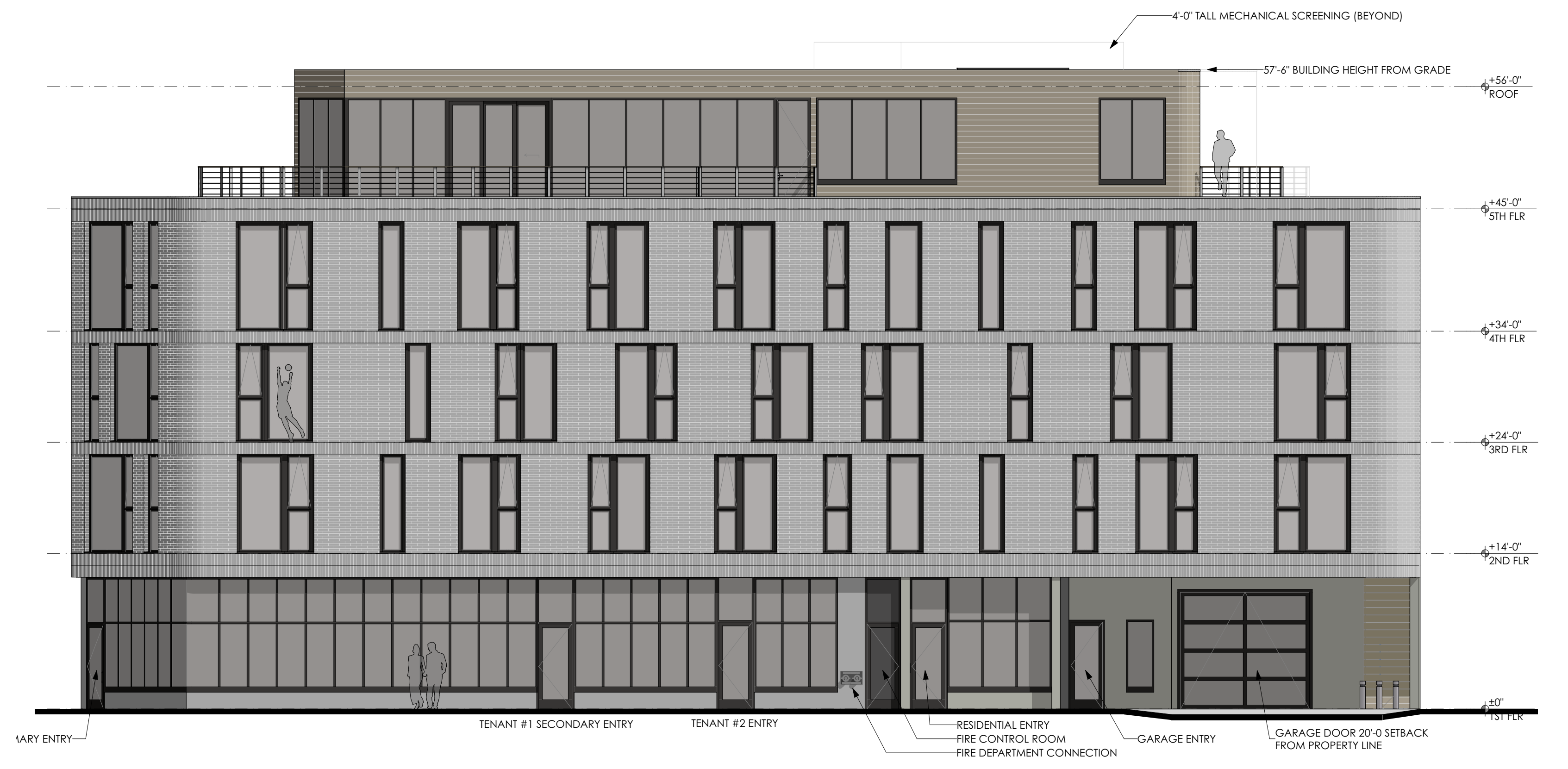
1 EAST ELEVATION (WASHINGTON AVE) SCALE: 1/8" = 1'-0"