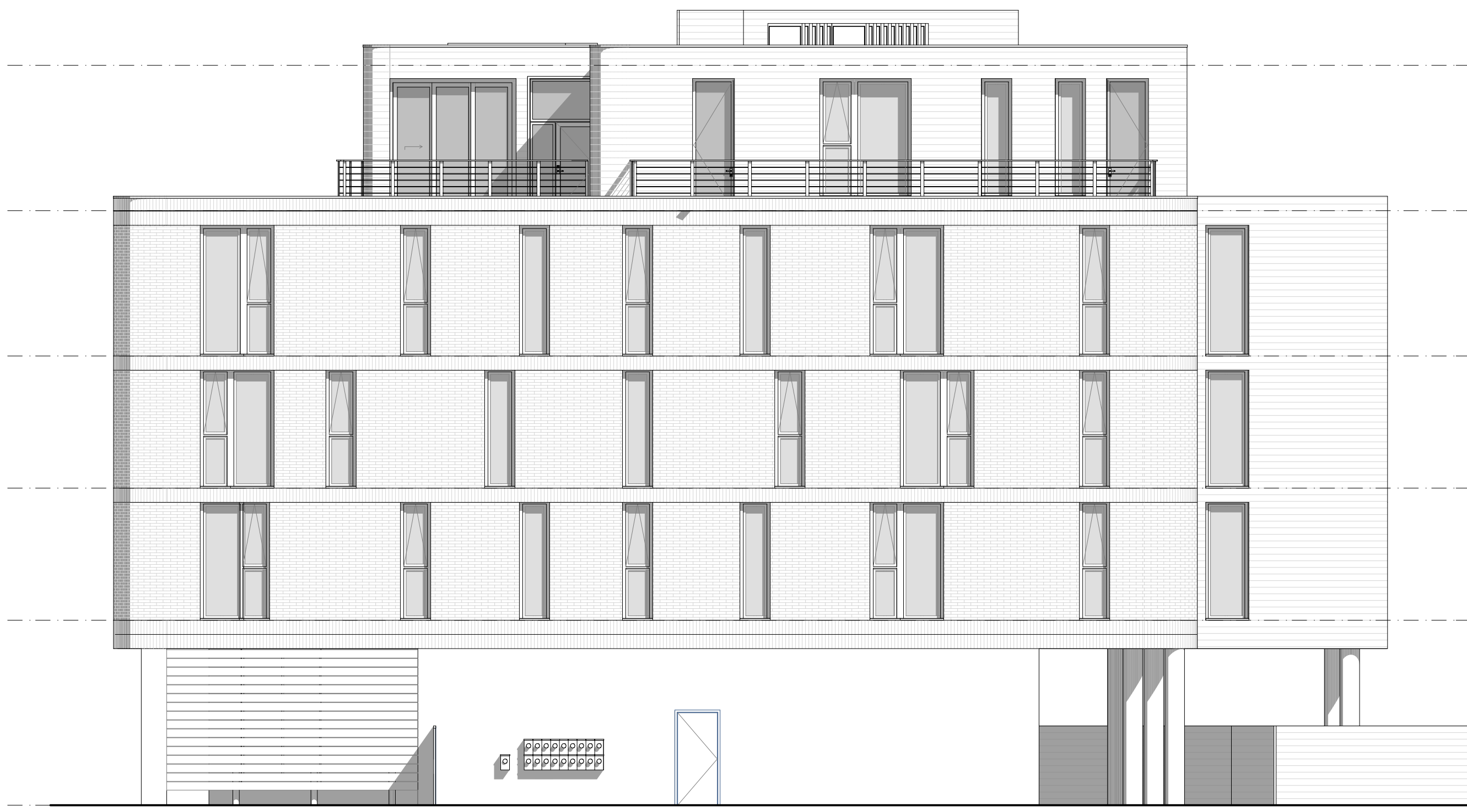
3 NORTH ELEVATION SCALE: 1/8" = 1'-0"