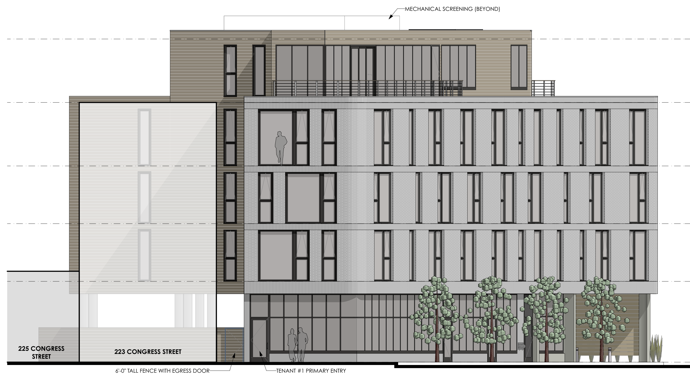
2 SOUTH ELEVATION (CONGRESS STREET) SCALE: 1/8" = 1'-0"

/Volumes/Network Files/CIAB/PROJECTS/B COMMERCIAL STUDIO/1 Current Projects/221 Congress/DRAWINGS/221 Congress_Current2.pln