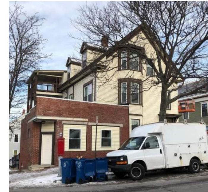
NEIGHBORHOOD FLAT ROOF ADDITION PHOTOS