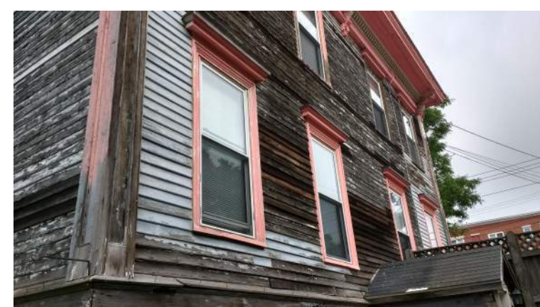
ORIGINAL CONDITIONS PHOTOS