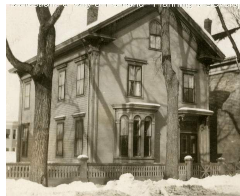
1924 TAX CARD IMAGE