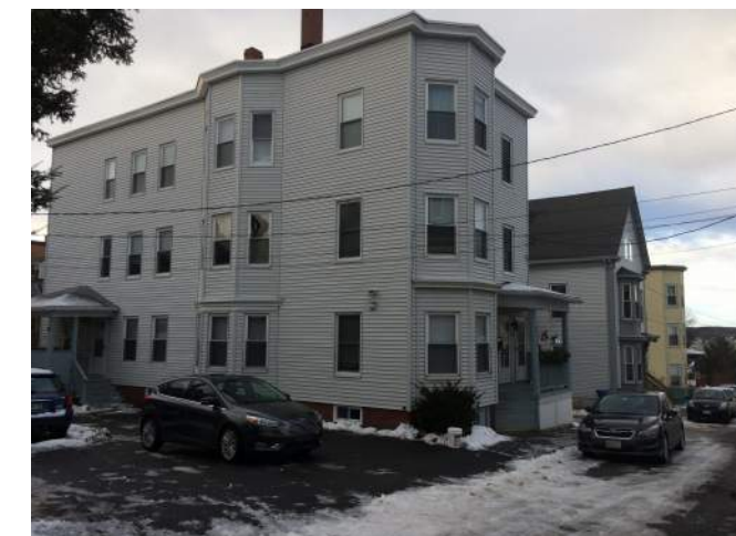
NEIGHBORHOOD CONTEXT PHOTOS