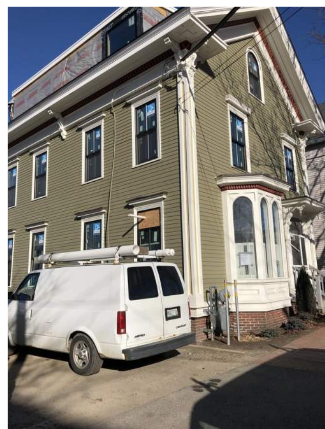
PHASE-I CONSTRUCTION PHOTO