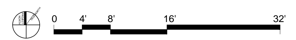
1 EQUIPMENT PLAN 1/8" = 1'-0"