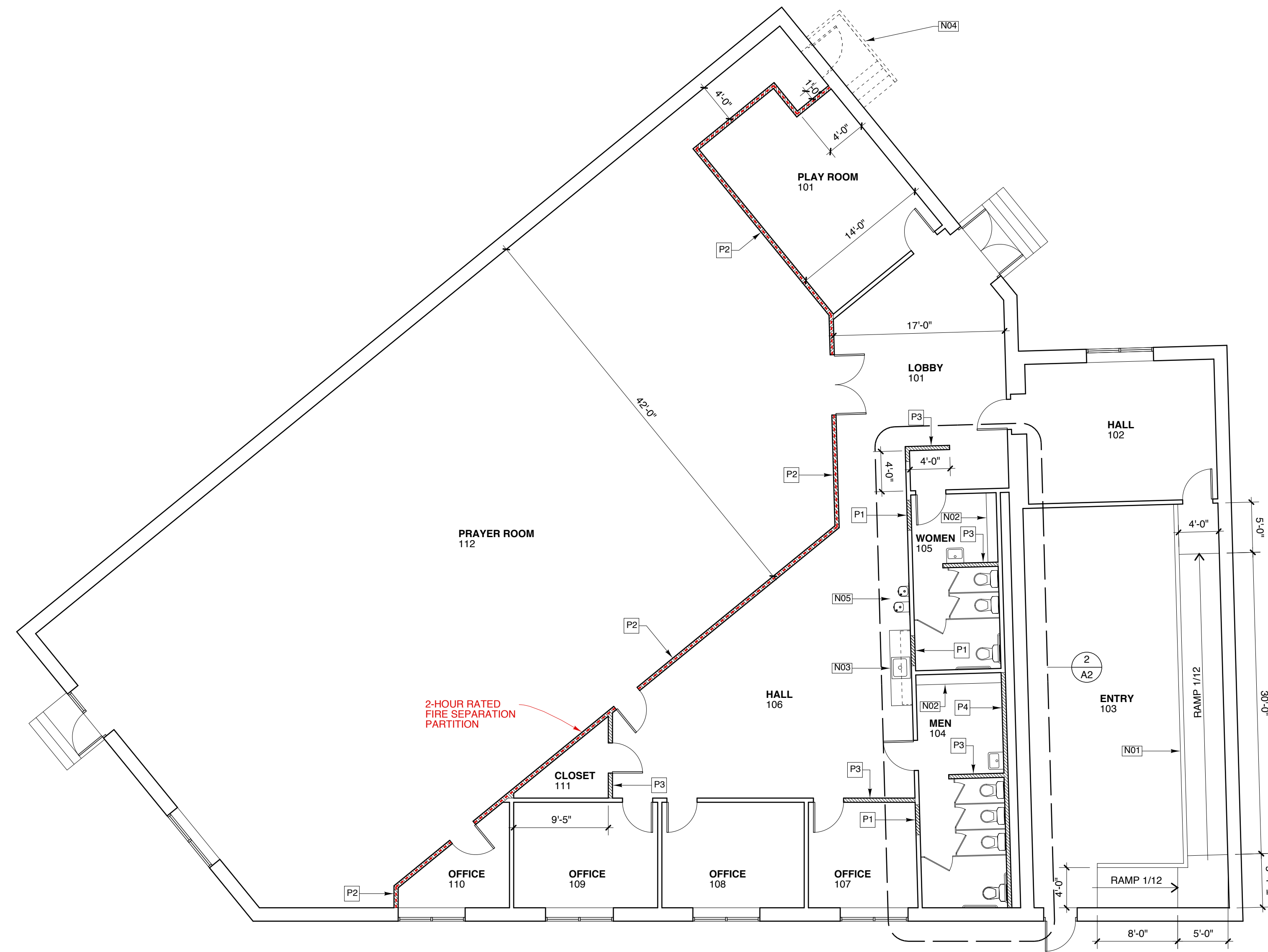
1 FLOOR PLAN SCALE: 1/8" = 1'-0" 2' 4' 8' 16'

PARTITIONS/WALLS KEY ——— EXISTING TO REMAIN ▨ NEW PARTITION/WALL