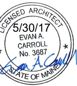
Bild Architecture PO Box 8235 Portland, ME 04104 207.408.0168 evan@bildarchitecture.com

PROJECT NO. 16042 PROJECT NAME 118 WASHINGTON AVE PORTLAND, ME 04101