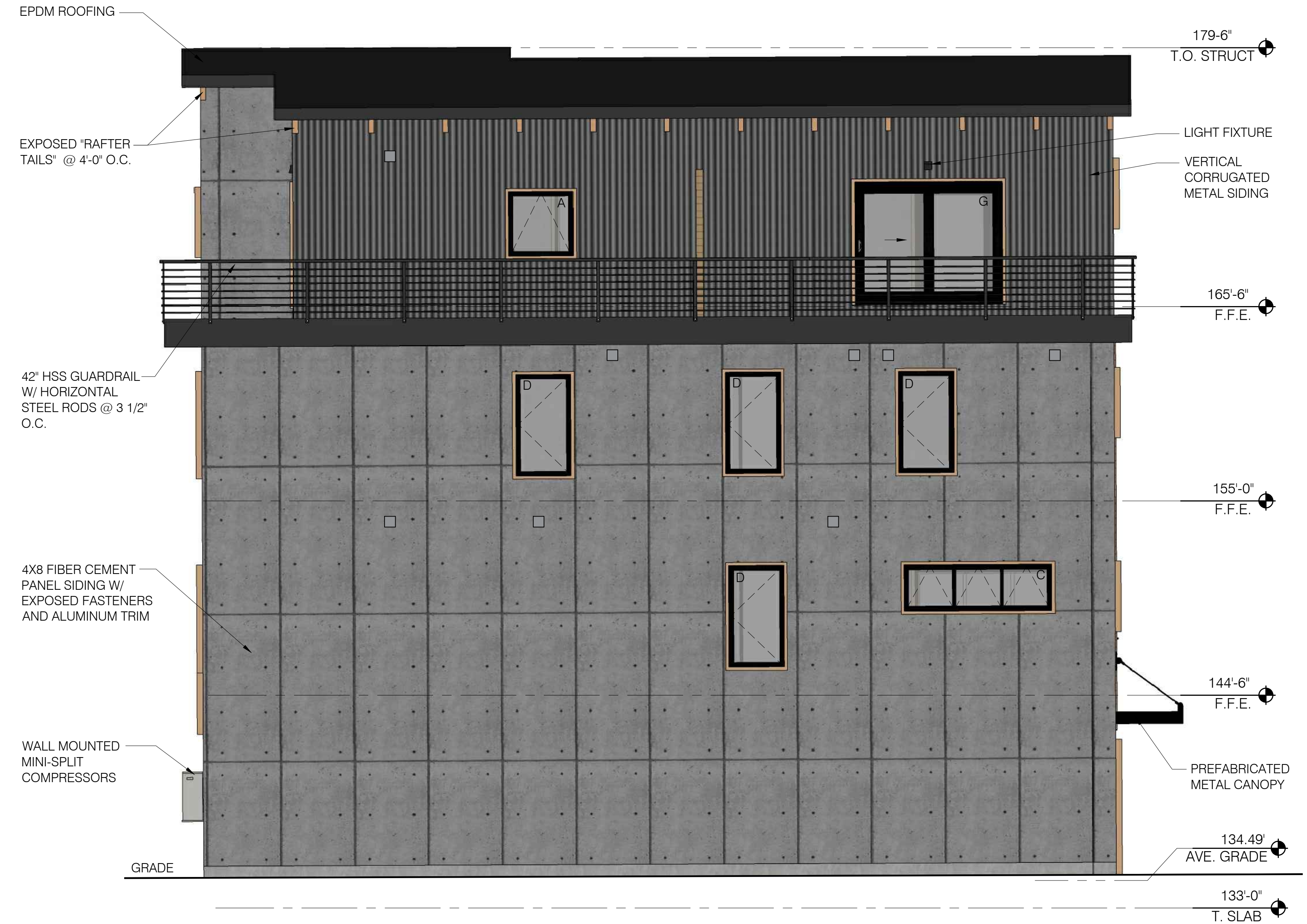
2 NORTHEAST ELEVATION SCALE: 1/4" = 1'-0"