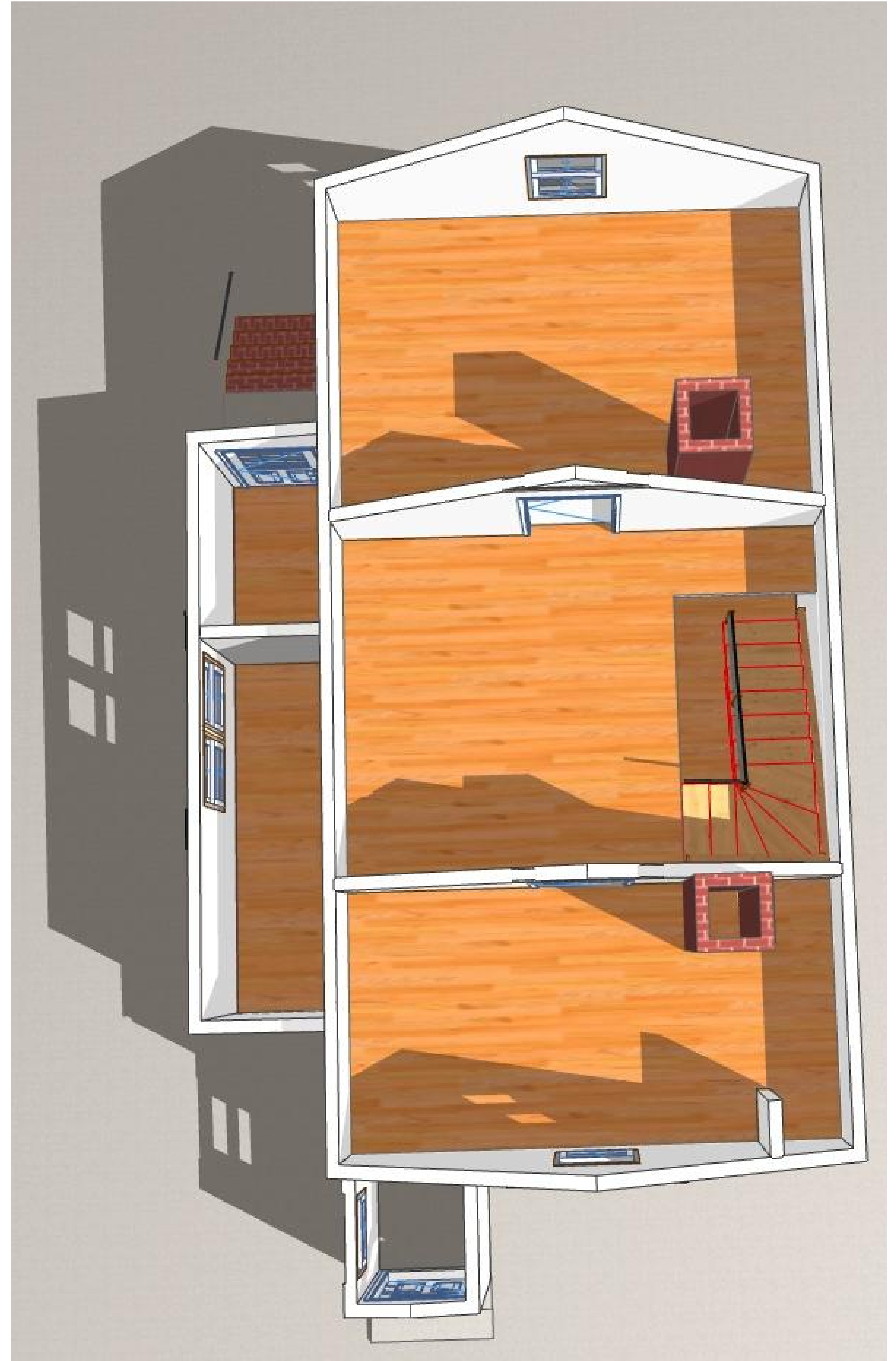
2 3D - EXISTING