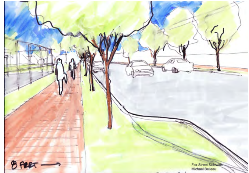
Sketch of sidewalk with curb extension, storm water parkway and trees.