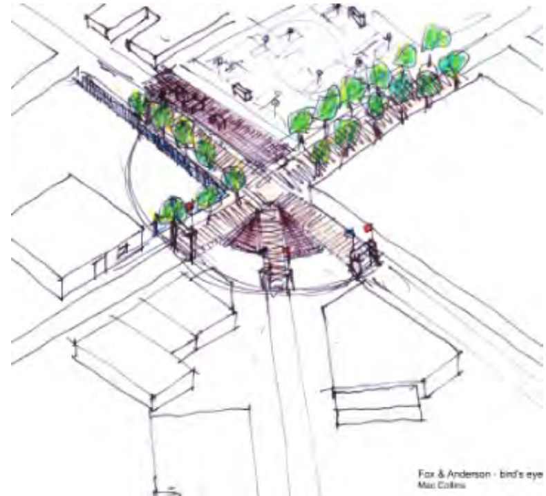
Top: Plan view of crosswalks, curb extension and a green space.