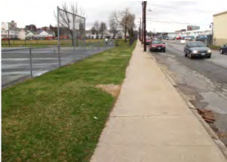
Existing sidewalk on Fox Street adjacent to Fox Field.