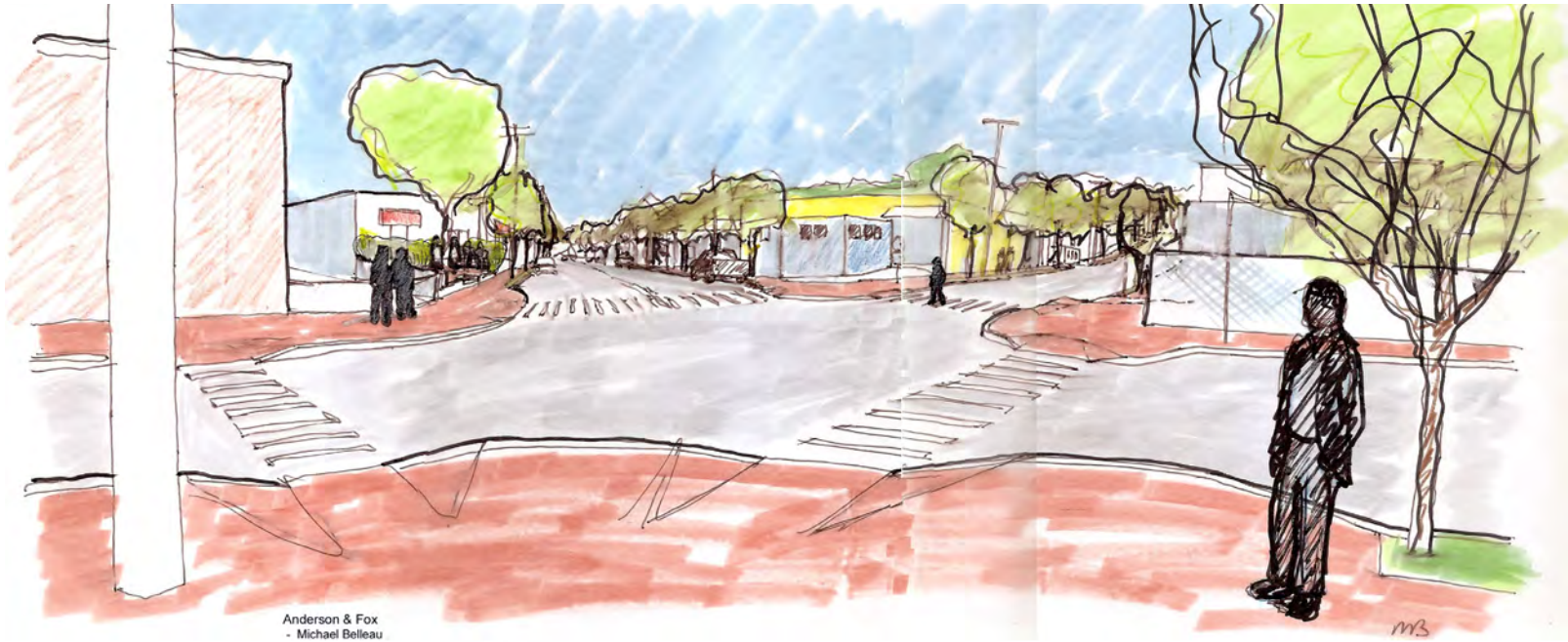
Above: The intersection of Fox and Anderson Streets today.