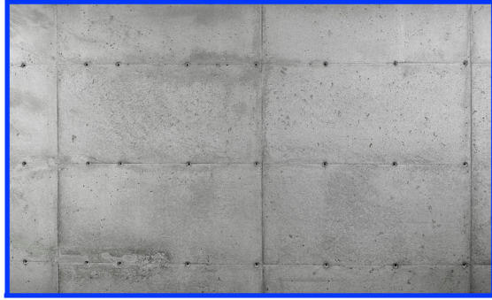
POURED IN PLACE CONCRETE WALL