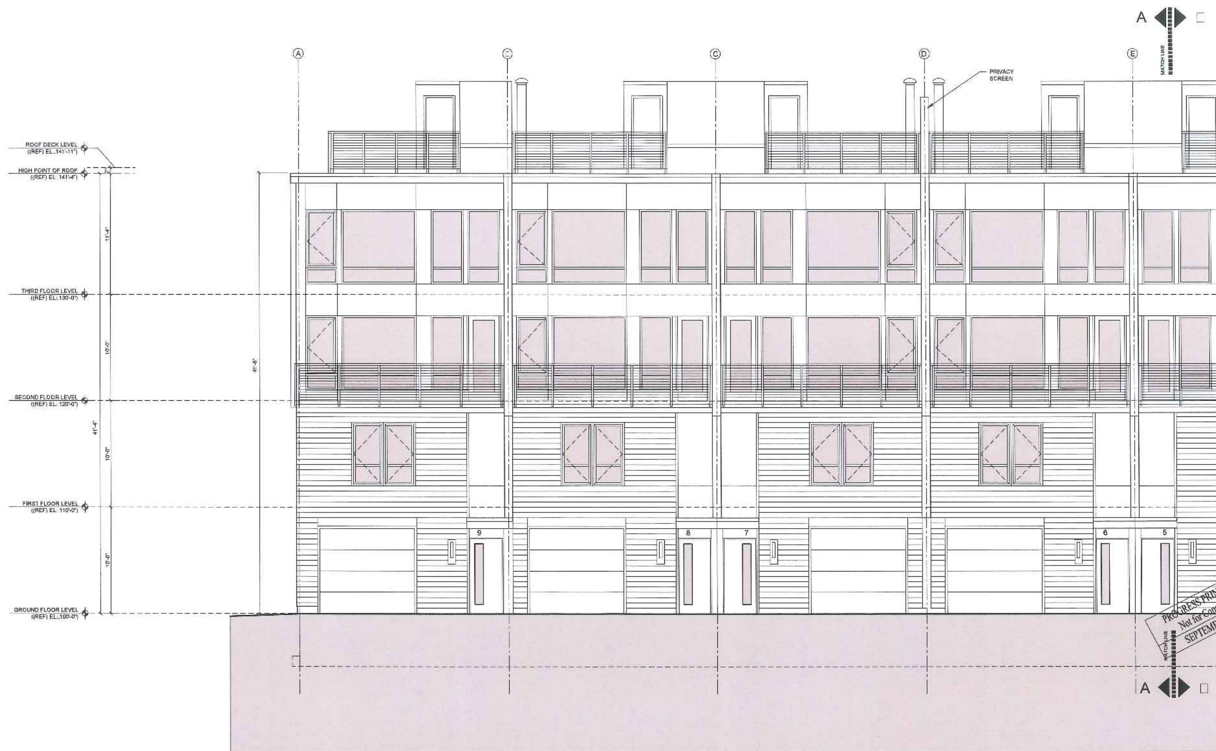
1 SOUTH ELEVATION - PART A 1/8" = 1'-0"