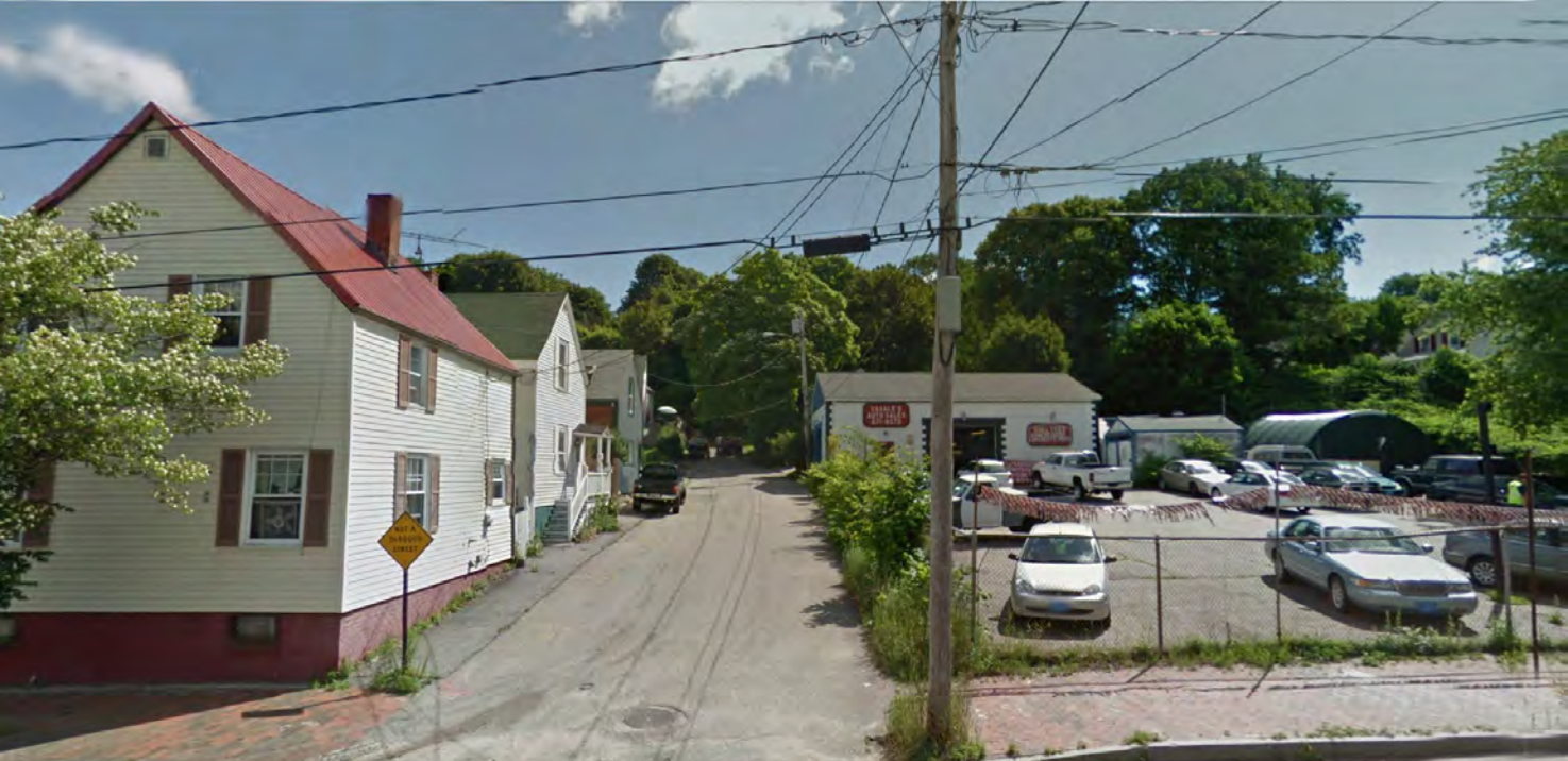
EXISTING VIEW FROM WASHINGTON LOOKING UP EAST COVE