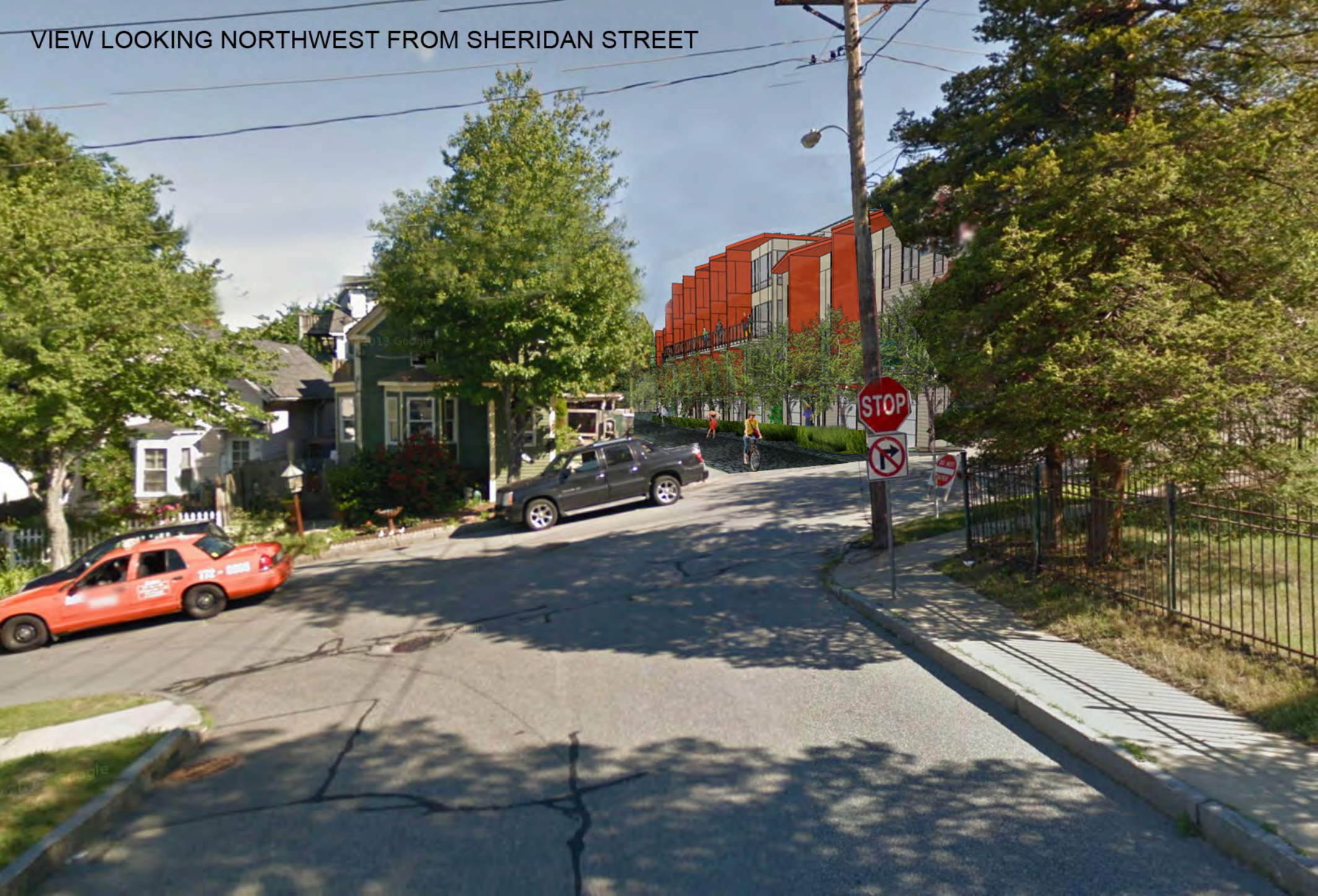
VIEW LOOKING NORTHWEST FROM SHERIDAN STREET