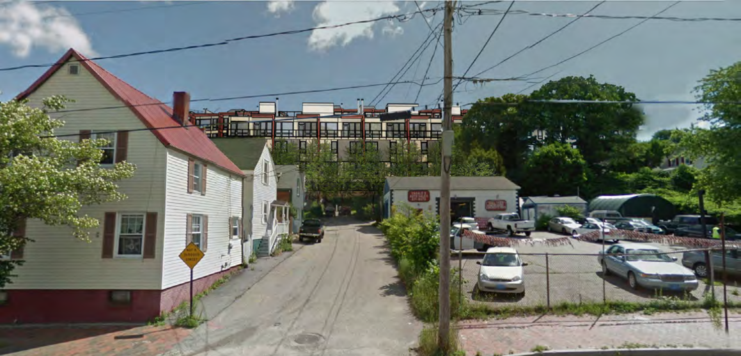
VIEW FROM WASHINGTON LOOKING UP EAST COVE