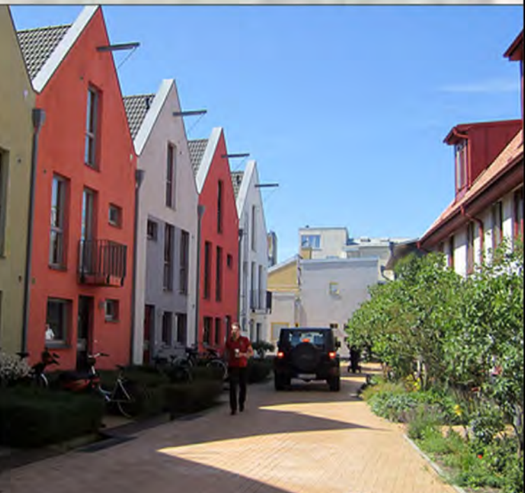
WOONERF / COMPLETE STREET