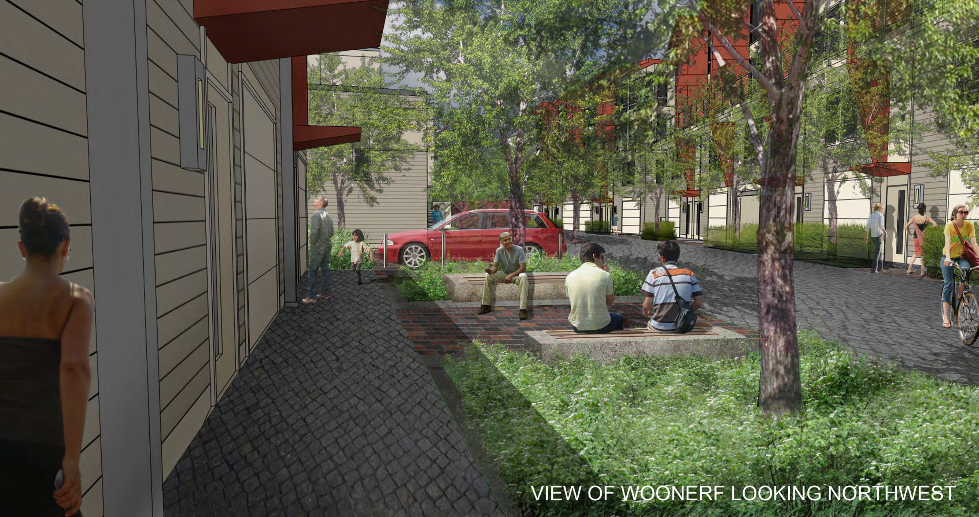
VIEW OF WOONERF LOOKING NORTHWEST