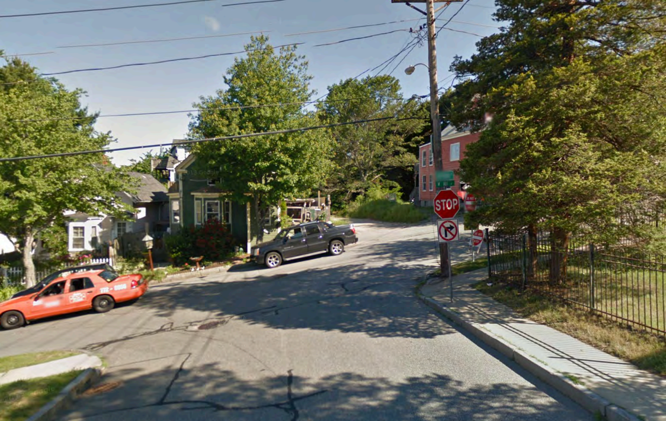
EXISTING VIEW LOOKING NORTHWEST FROM SHERIDAN