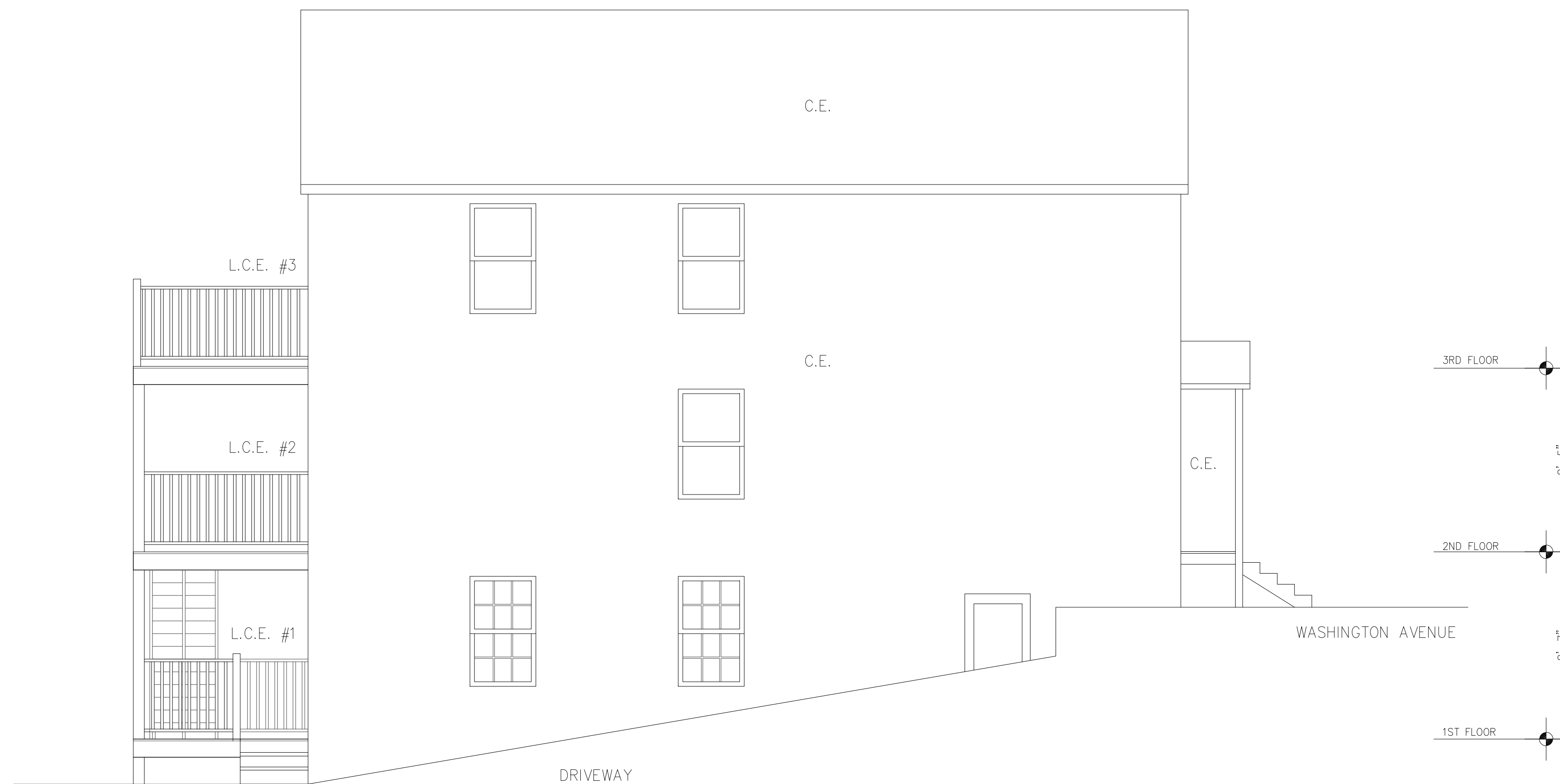
1 FRONT ELEVATION SCALE = 1/4" = 1'-0"