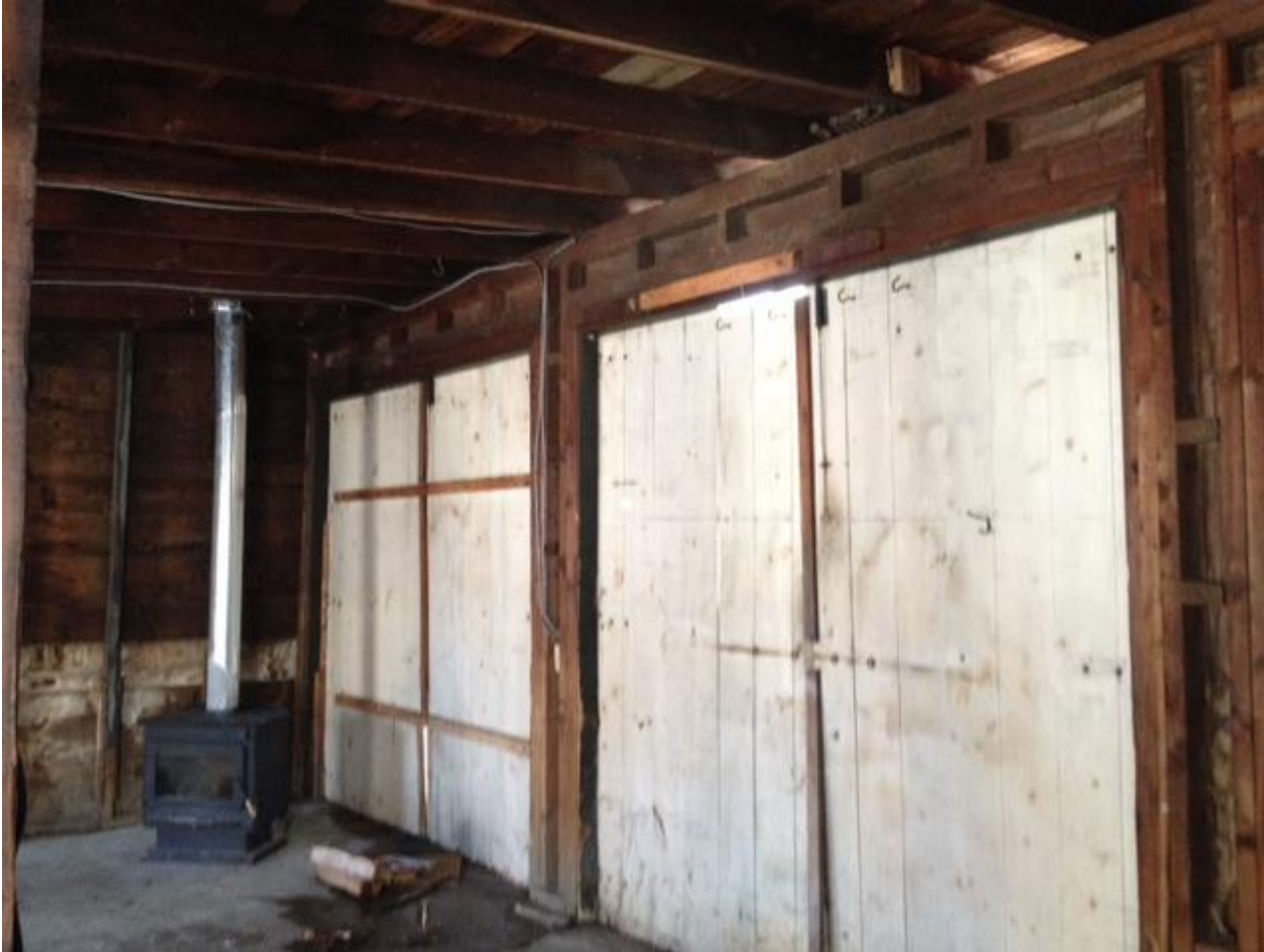
Existing Framing and barn door that will be framed in.