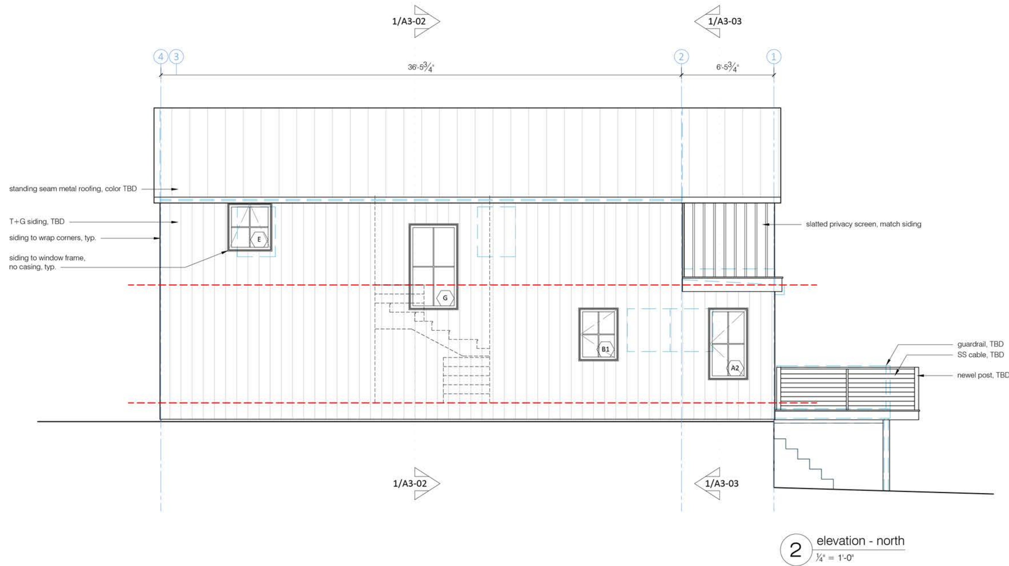
2 elevation - north 1/4" = 1'-0"