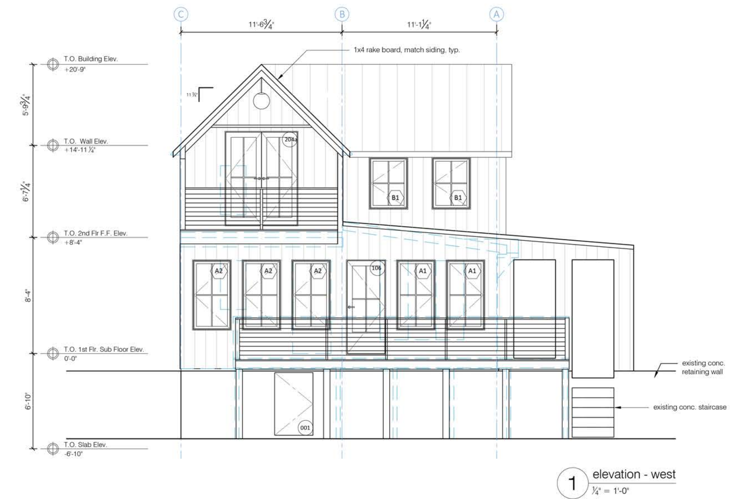
1 elevation - west 1/4" = 1'-0"