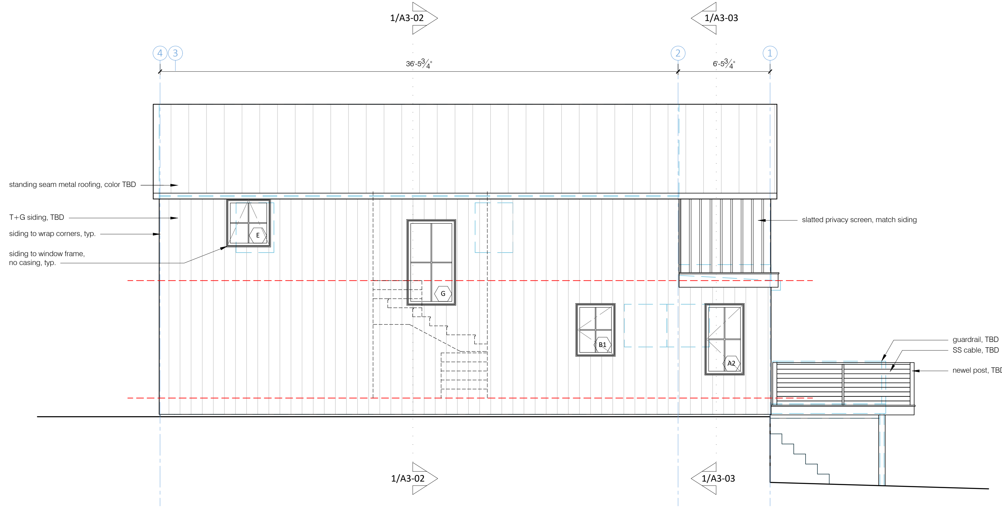
2 elevation - north 1/4" = 1'-0"