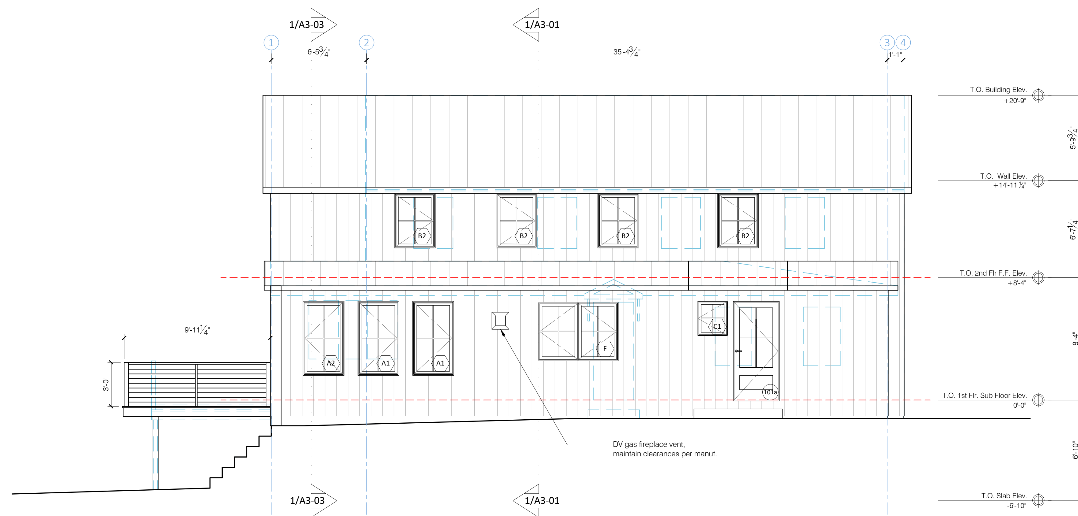
1 elevation - south 1/4" = 1'-0"