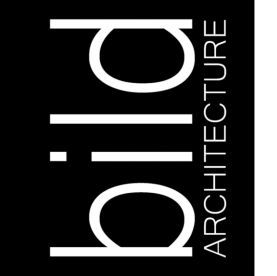
Bild Architecture PO Box 8235 Portland, ME 04104 207.408.0168 evan@bildarchitecture.com

ADA Title III states that the building does not require the installation of an elevator that is less than 3 stories or has less than 3000 sq ft per story.