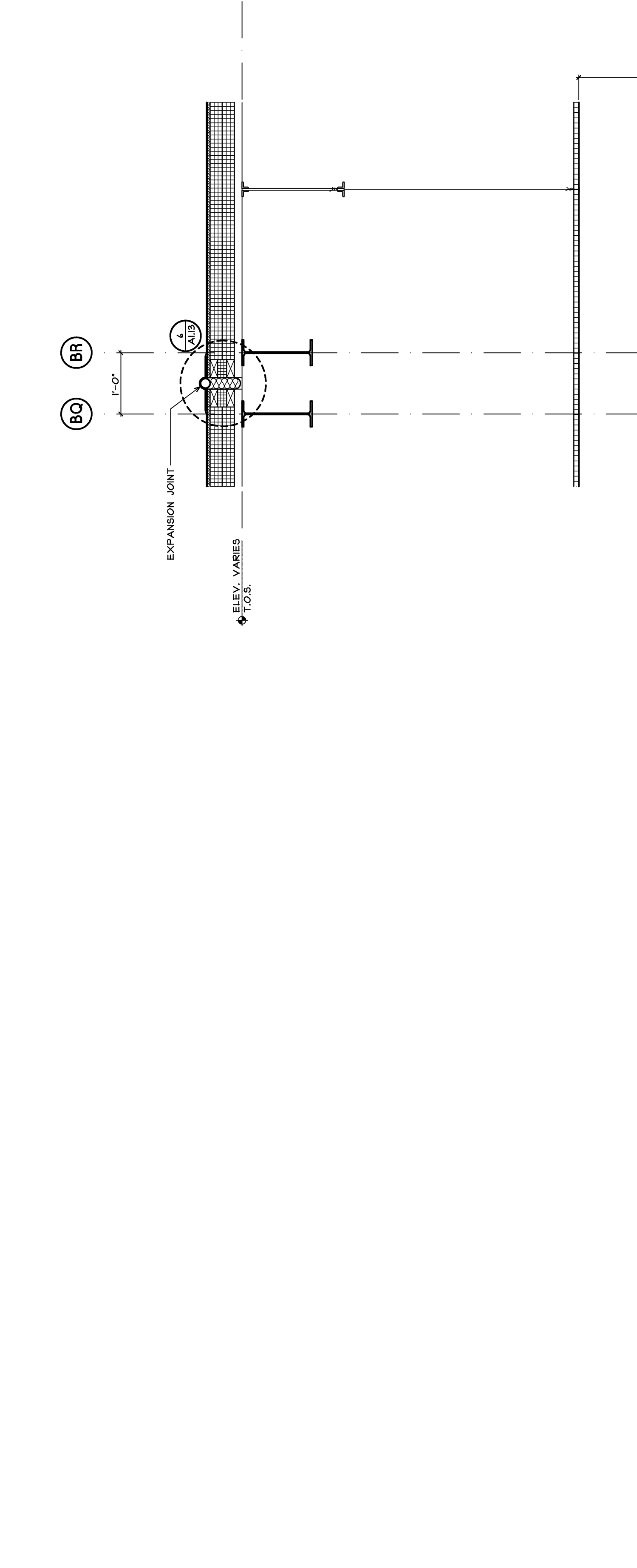
35 WALL SECTION A3.10 SCALE: 3/4" = 1'-0"