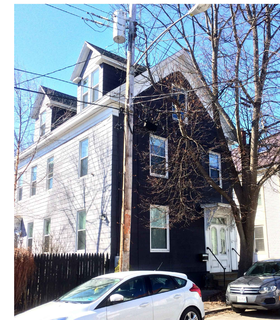
2 Existing Building