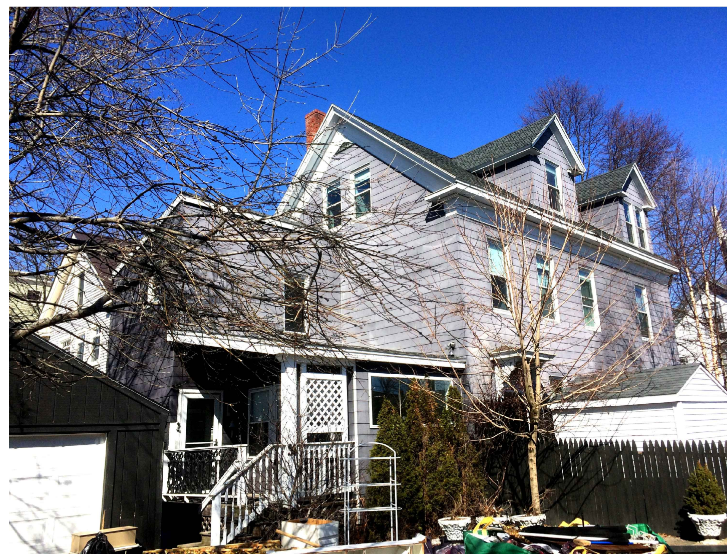
3 Existing Building