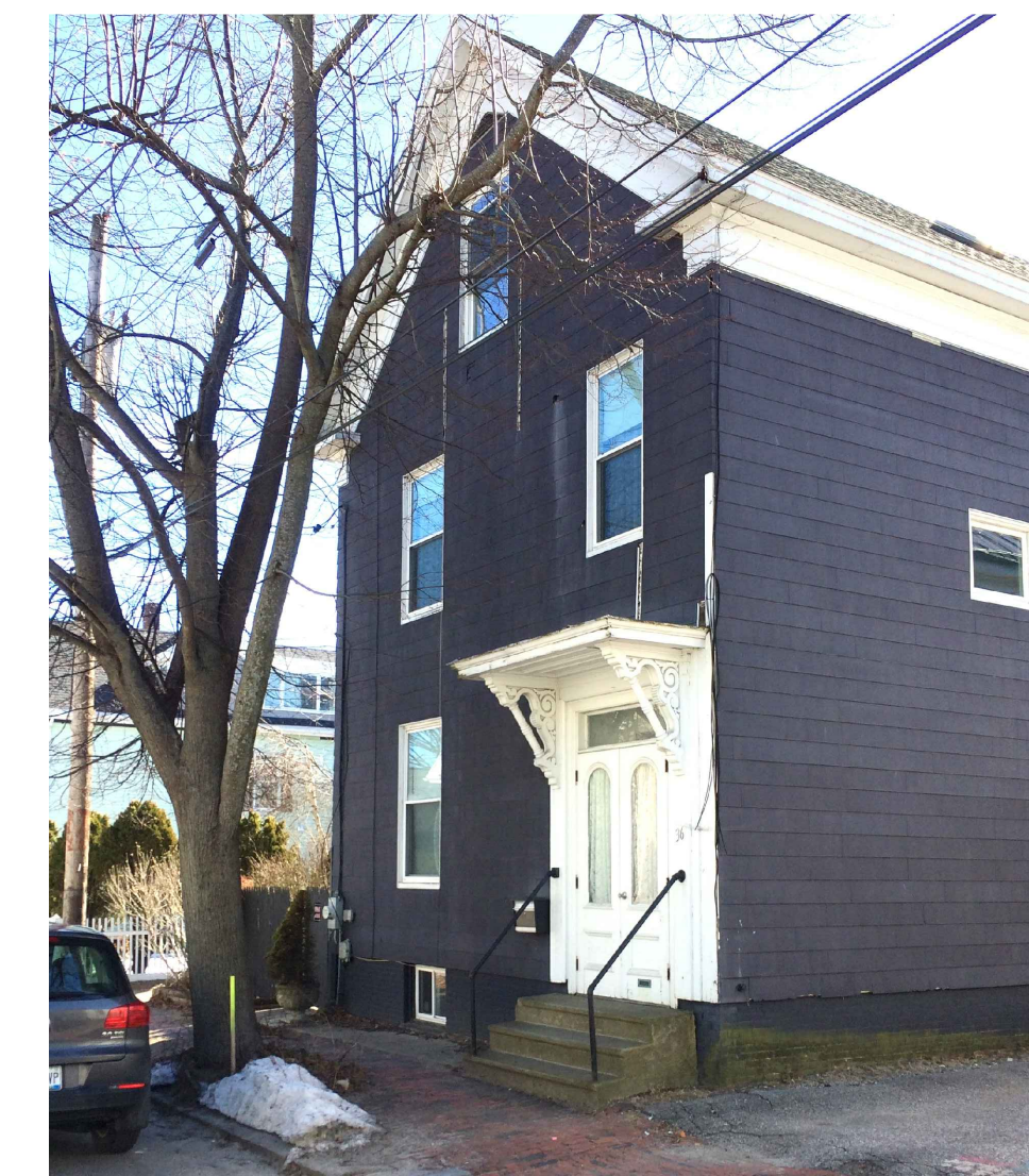
1 Existing Building