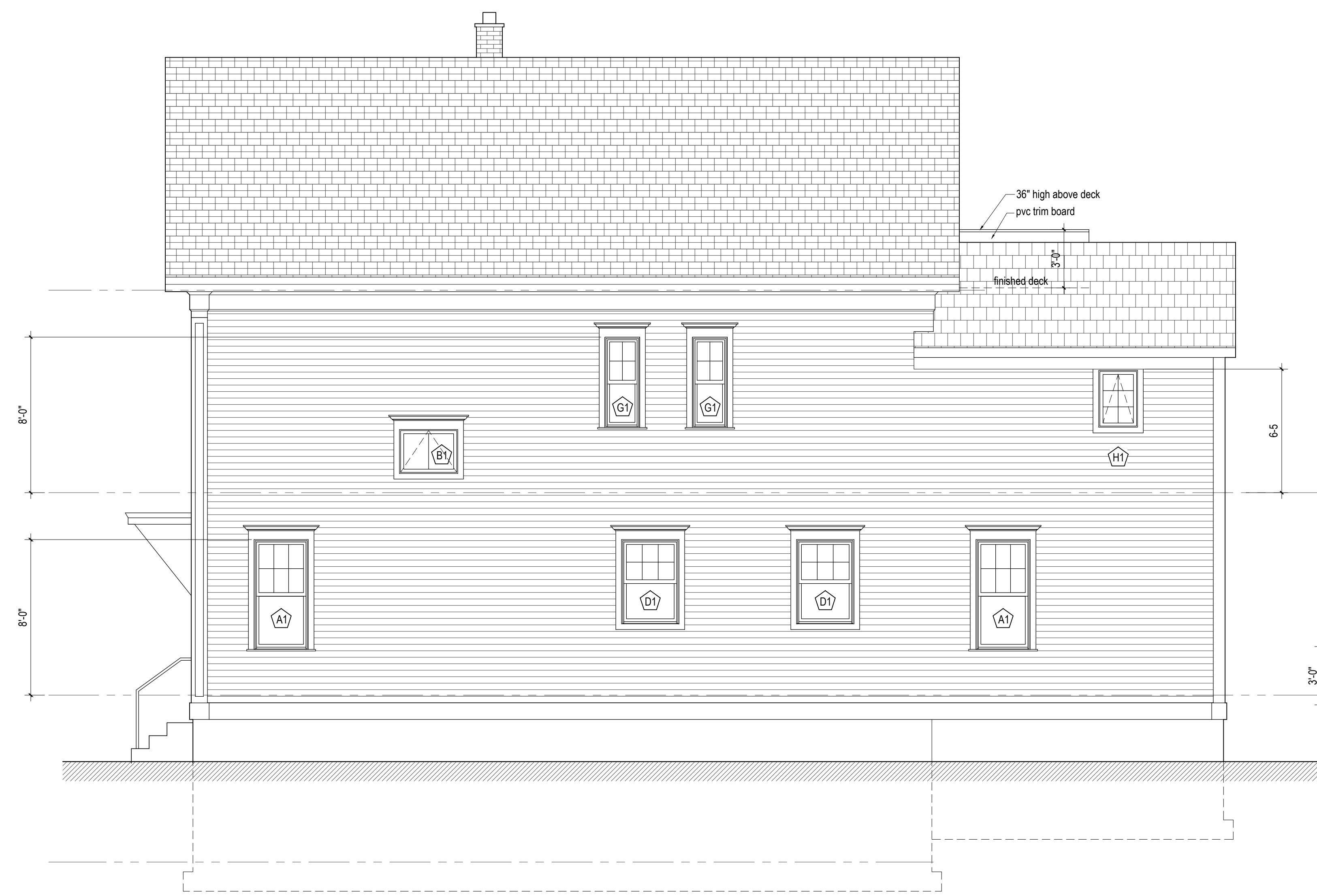
2 North (alley) Exterior Elevation: 1/4" = 1'-0"