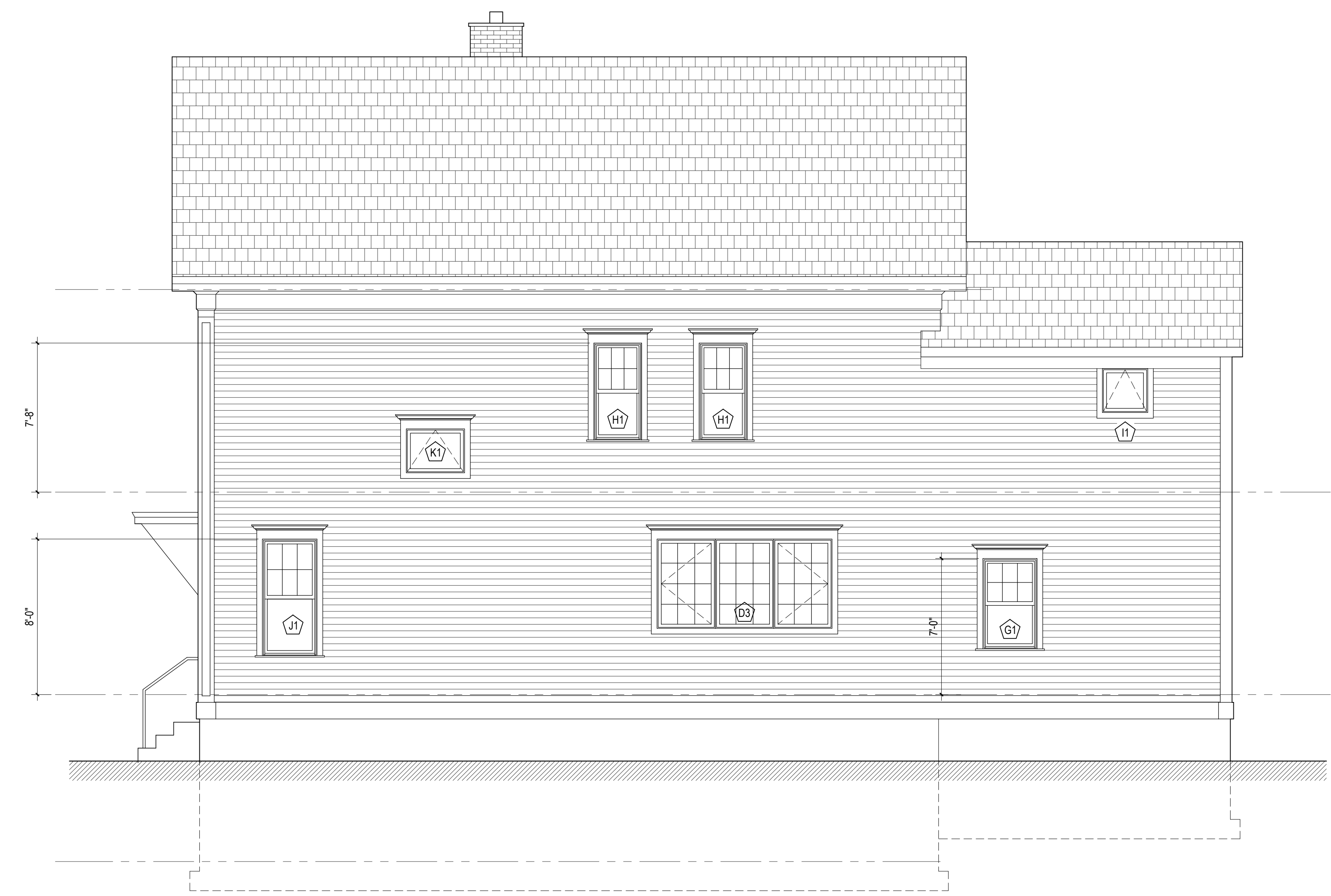
1 North (alley) Exterior Elevation: 1/4"=1'-0"