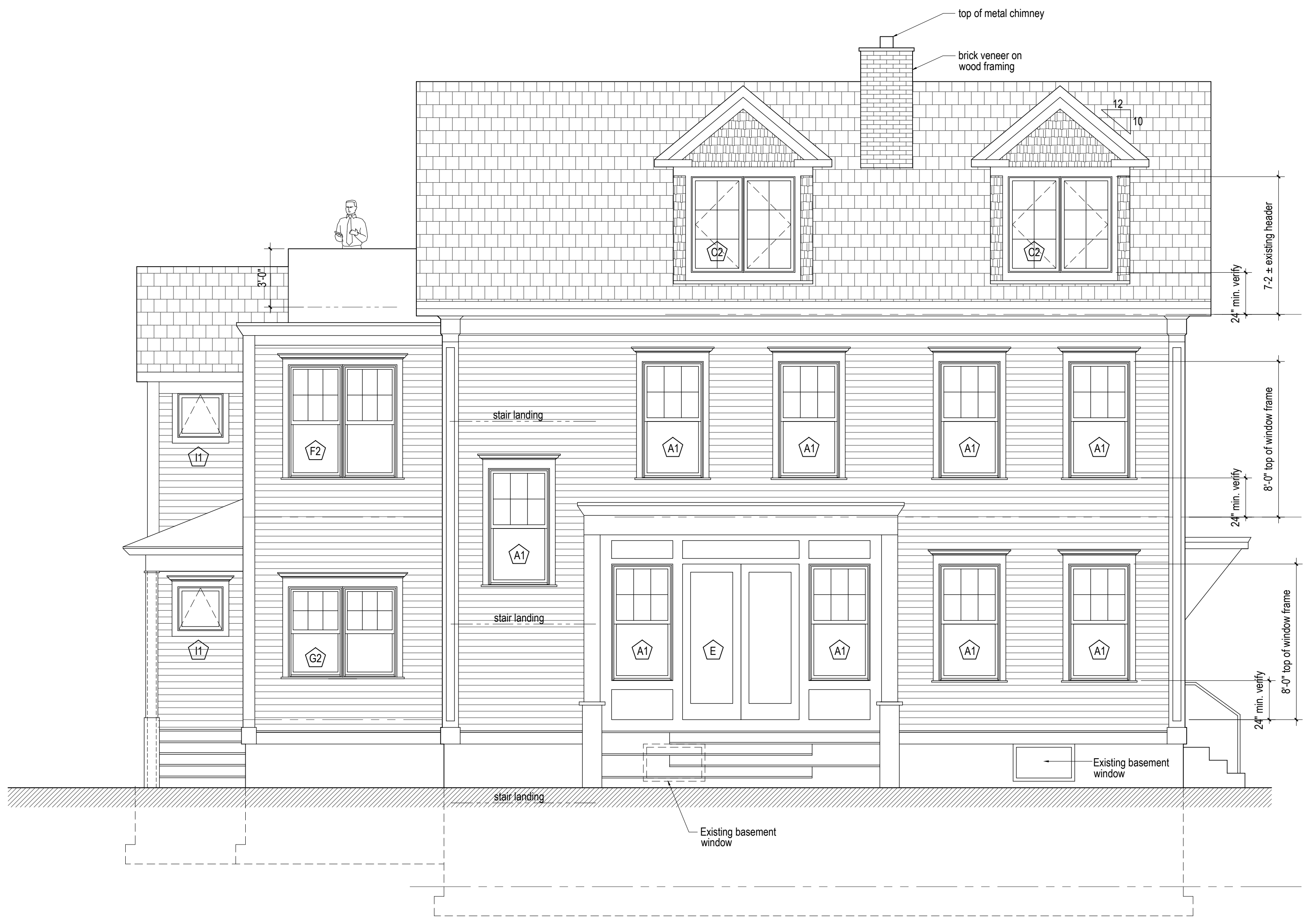
2 South (side) Exterior Elevation: 1/4" = 1'-0"

Notes: 1. Window Designations are for Marvin Integrity Ultrex with Wood Interior 2. Doors to be determined 3. A1 shall be a single unit of A window. A2 shall be (2) A units mullied together. And so on... 4. Coordinate sill with backslash at counter