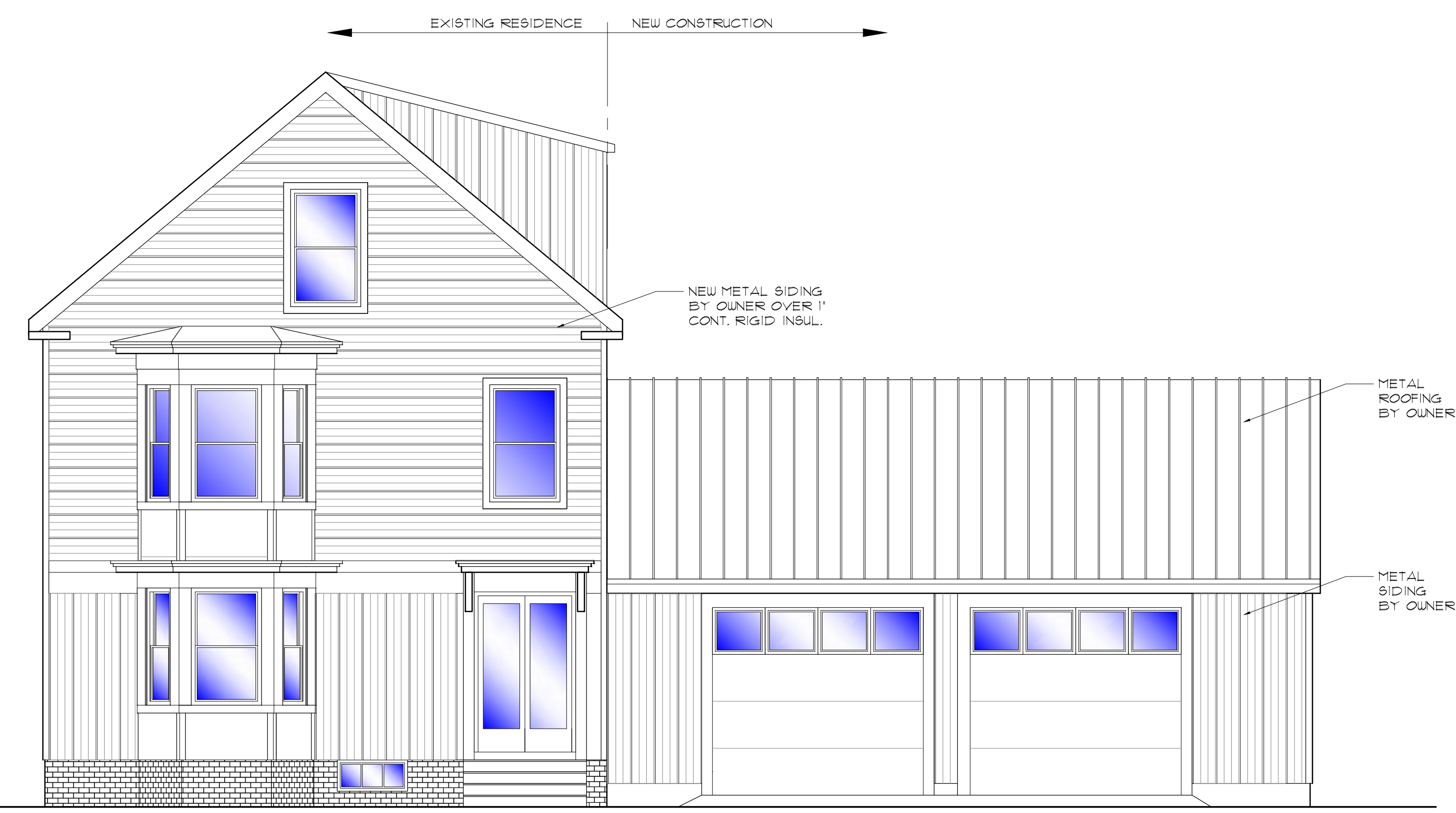
REMODELED FRONT ELEVATION SCALE: 3/16" = 1'-0"