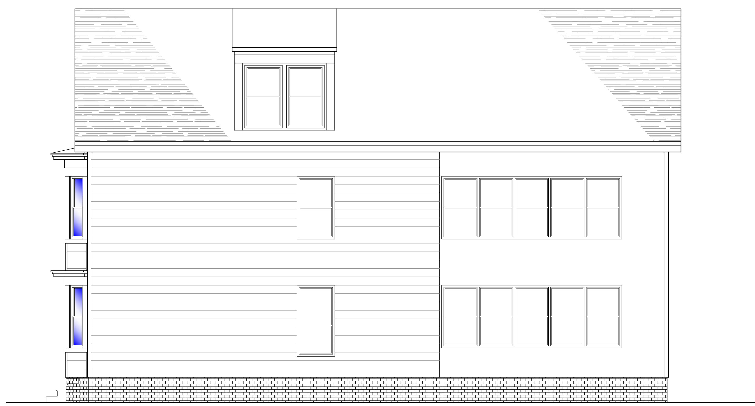
EXISTING RIGHT SIDE ELEVATION SCALE: 1/4" = 1'-0"