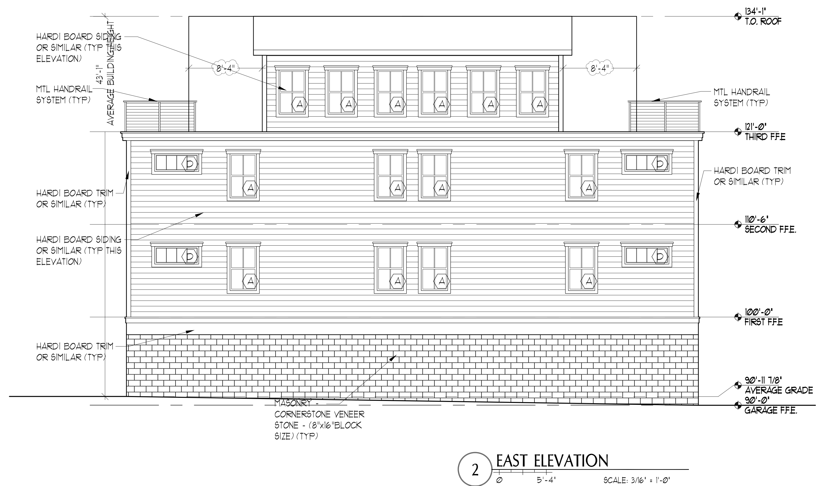
2 EAST ELEVATION SCALE: 3/16" = 1'-0"