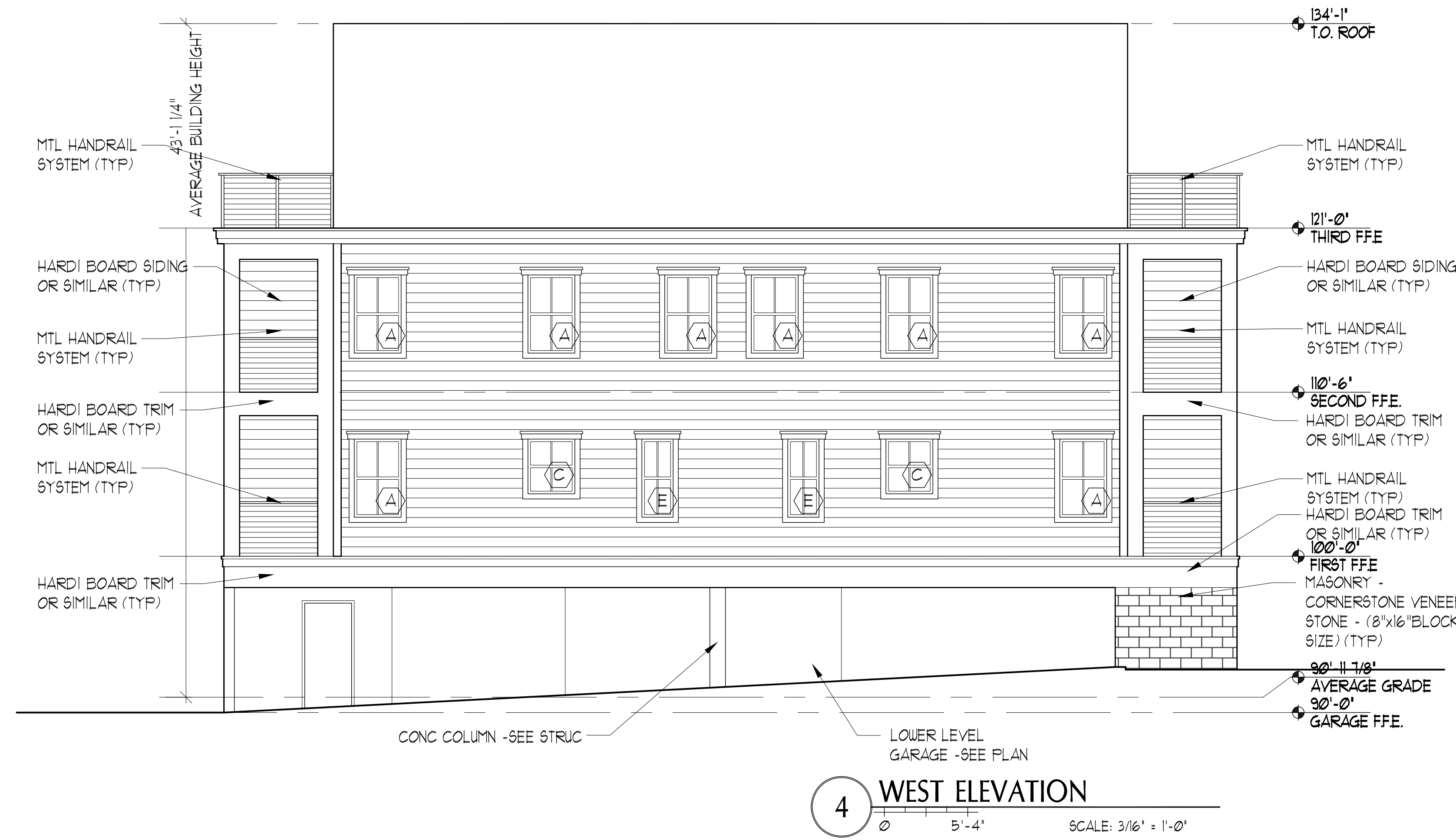
4 WEST ELEVATION SCALE: 3/16" = 1'-0"